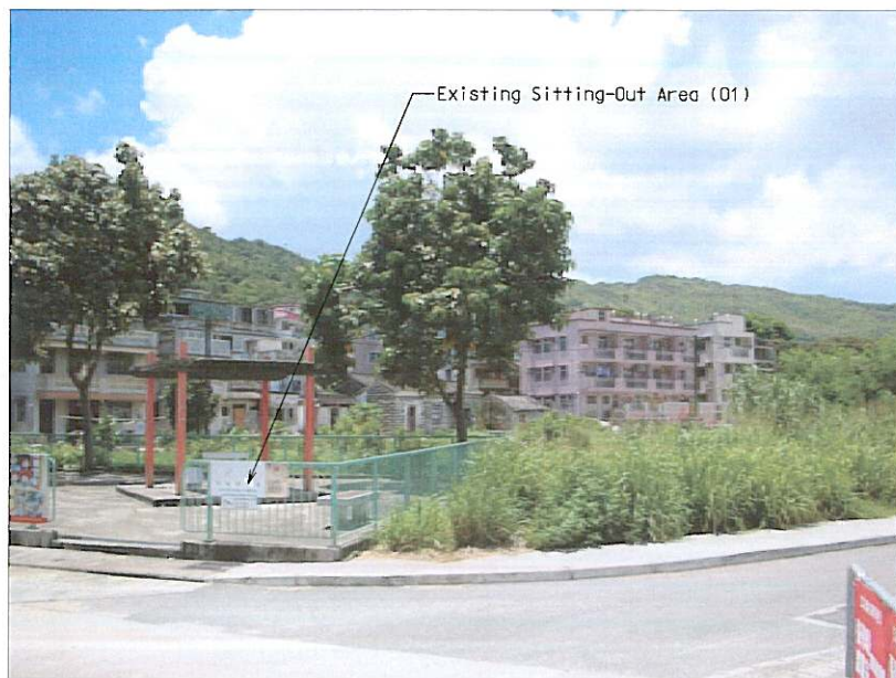
Photo No. C7 - 01 Sitting-out Area at Ma On Kong