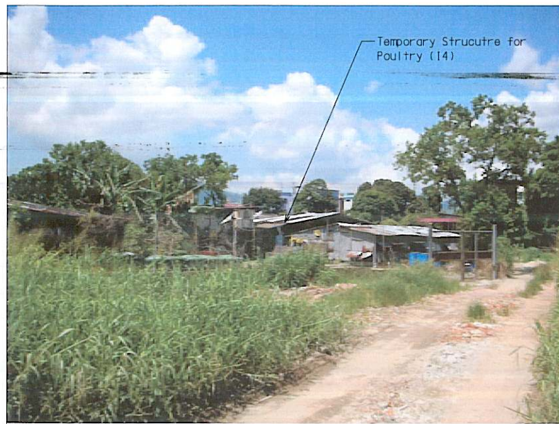
Photo No. C4 - 14 Temporary structure for poultry east to Ho Pui