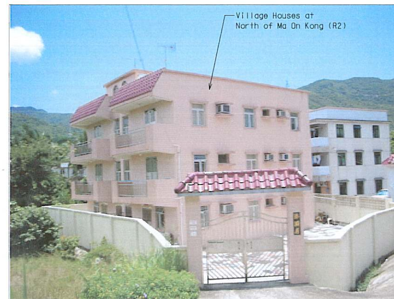
Photo No. C9 - R2 North of Ma On Kong