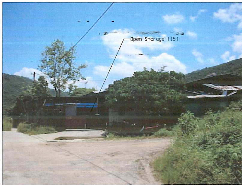
Photo No. C5 - 15 Open Storage at the end of village access