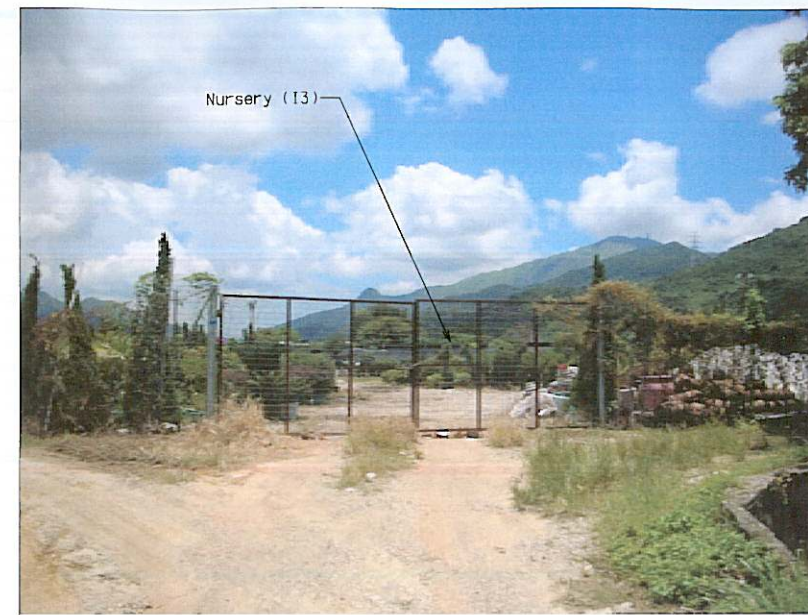
Photo No. C3 - 13 Nursery at the west of Ma On Kong Channel