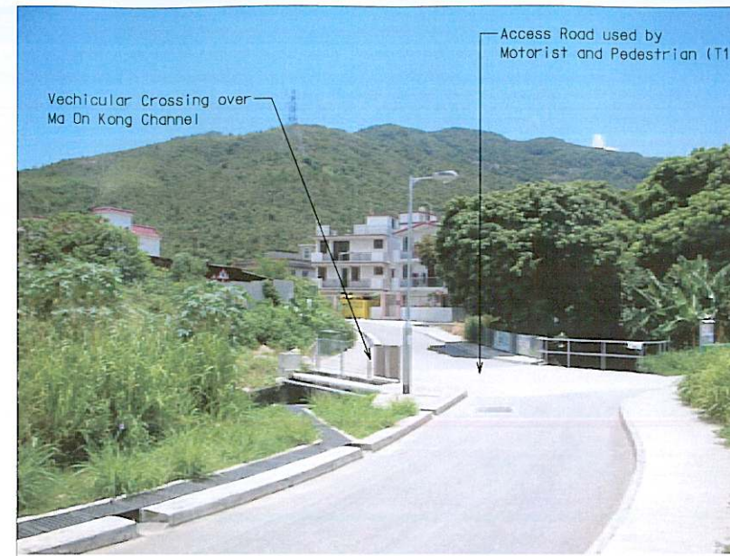
Vehicular Crossing over Ma On Kong Channel