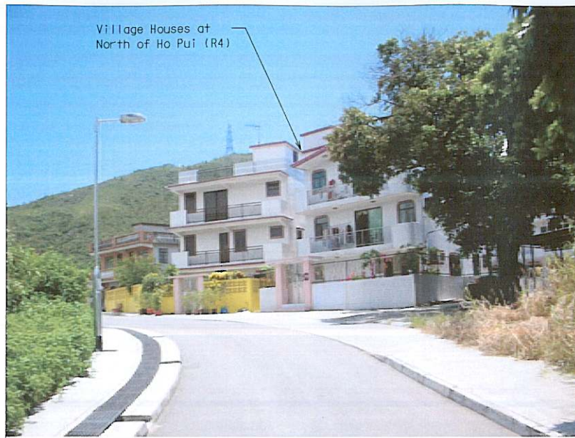
Village Houses at North of Ho Pui (R4)