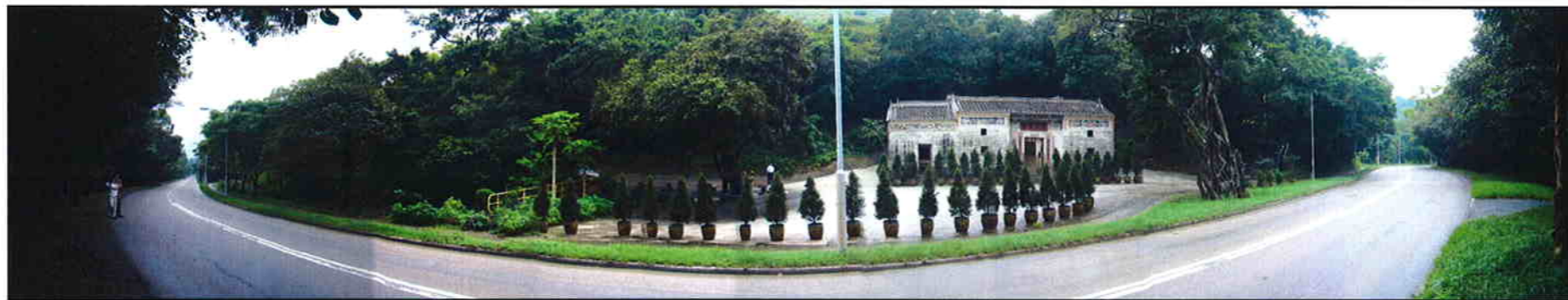
PHOTO OF EXISTING CHEUNG SHAN MONASTERY