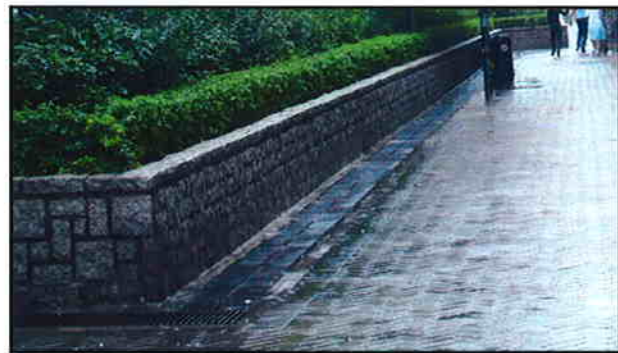
PROPOSED TEXTURE OF PLANTER WALL