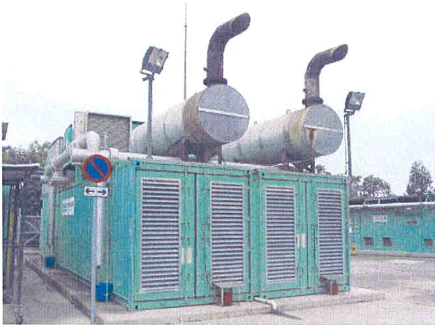
Gensets for power generation using LFG