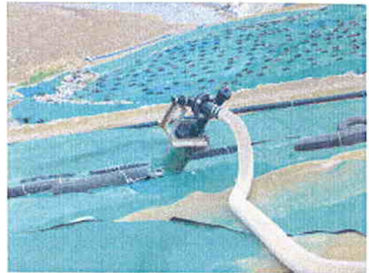
Well head & pipeline for extraction and conveyance of LFG