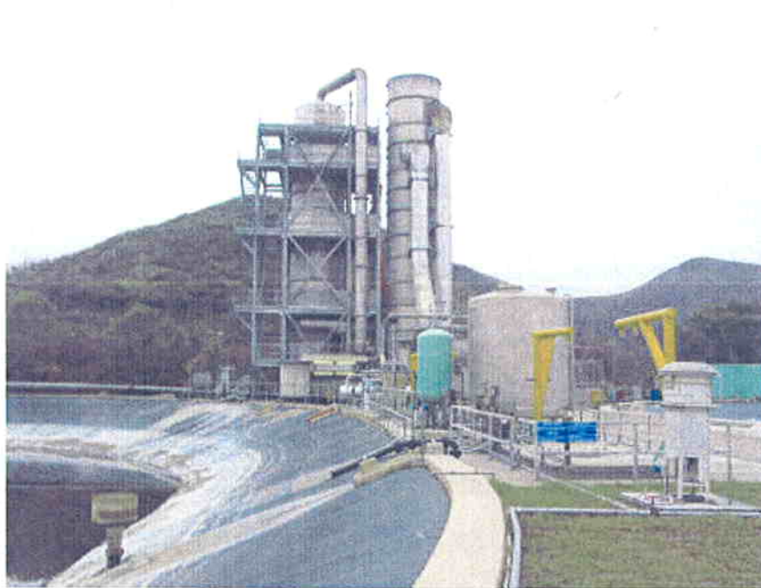
Ammonia stripping plant using LFG to heat up raw leachate