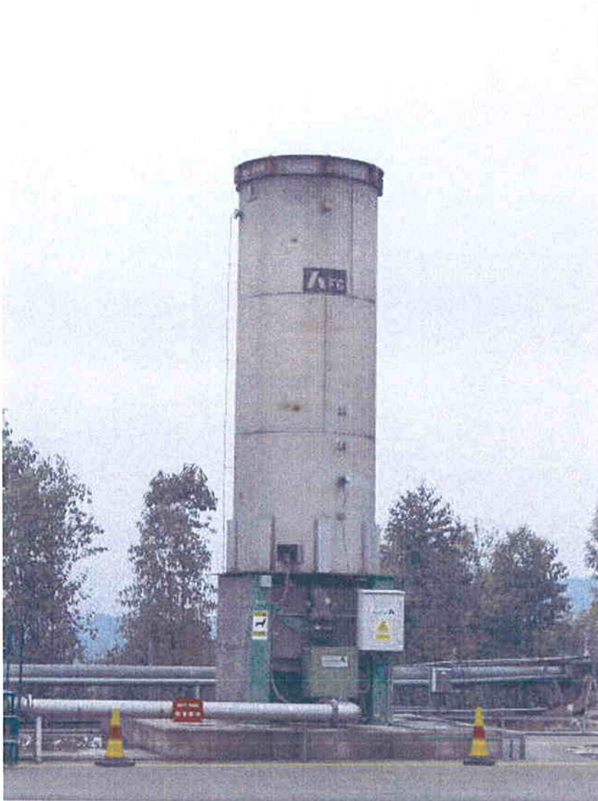
Flare for combustion of LFG