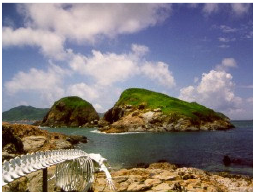
Cape' D Aguilar Marine Reserve