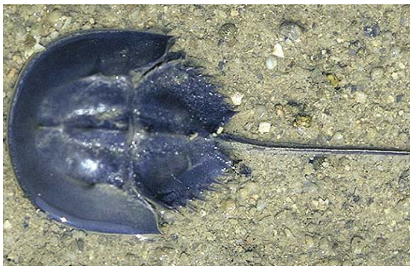
Horseshoe crab ( Tachypleus tridentatus )