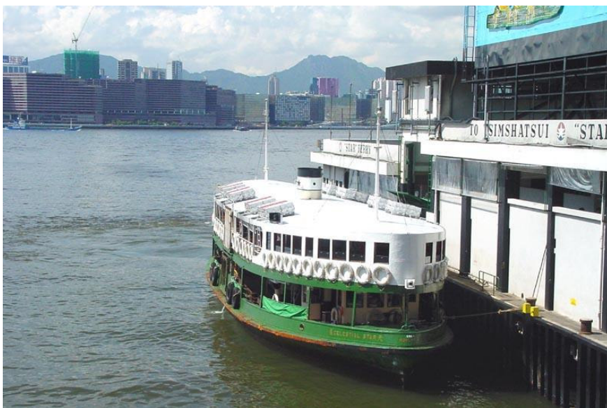
Victoria Harbour (Within Victoria Harbour Water Control Zone)