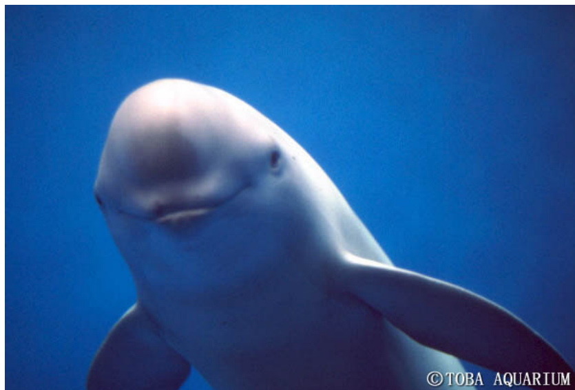
Finless Porpoise ( Neophocaena phocaenoides )