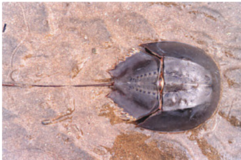
Horseshoe crab ( Carcinoscorpius rotundicauda )