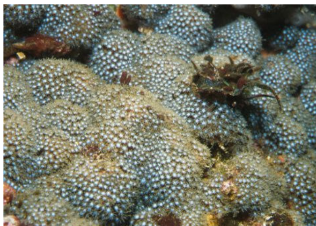
Faviid ( Cyphastrea microphthalma )