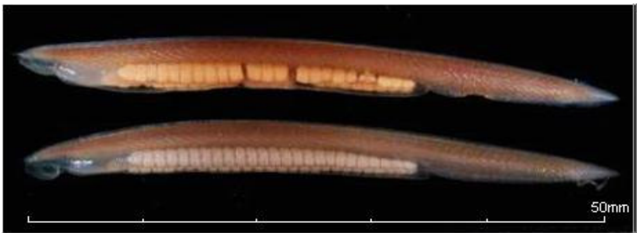
Amphioxus (Branchiostoma belcheri)