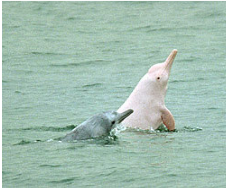
Chinese White Dolphin ( Sousa chinensis )