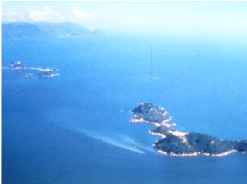
Sha Chau and Lung Kwu Chau Marine Park