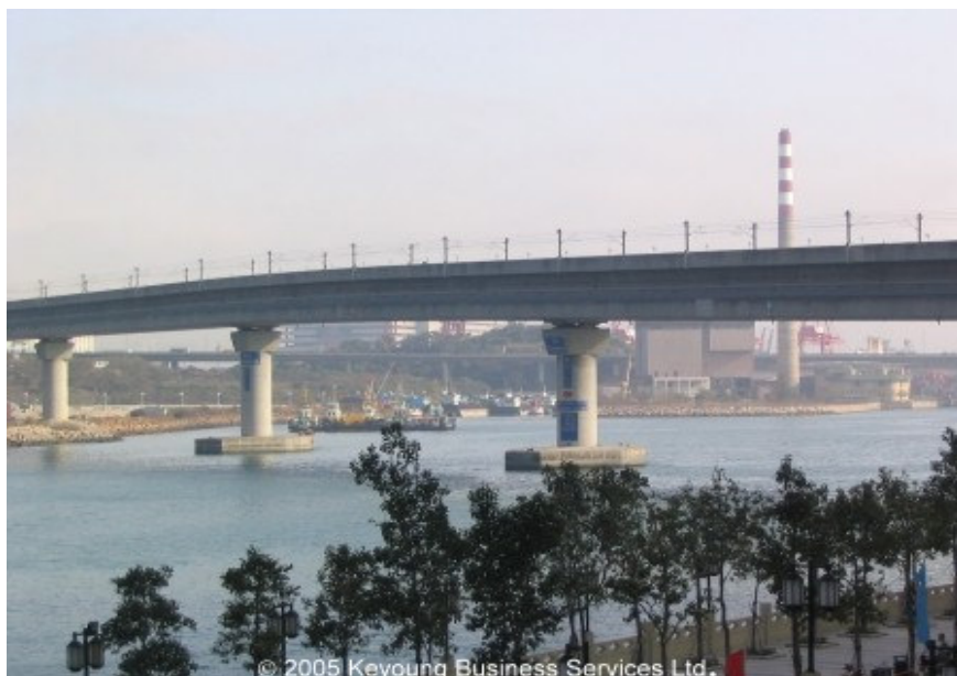
Tsing Yi (Within Western Buffer Water Control Zone)