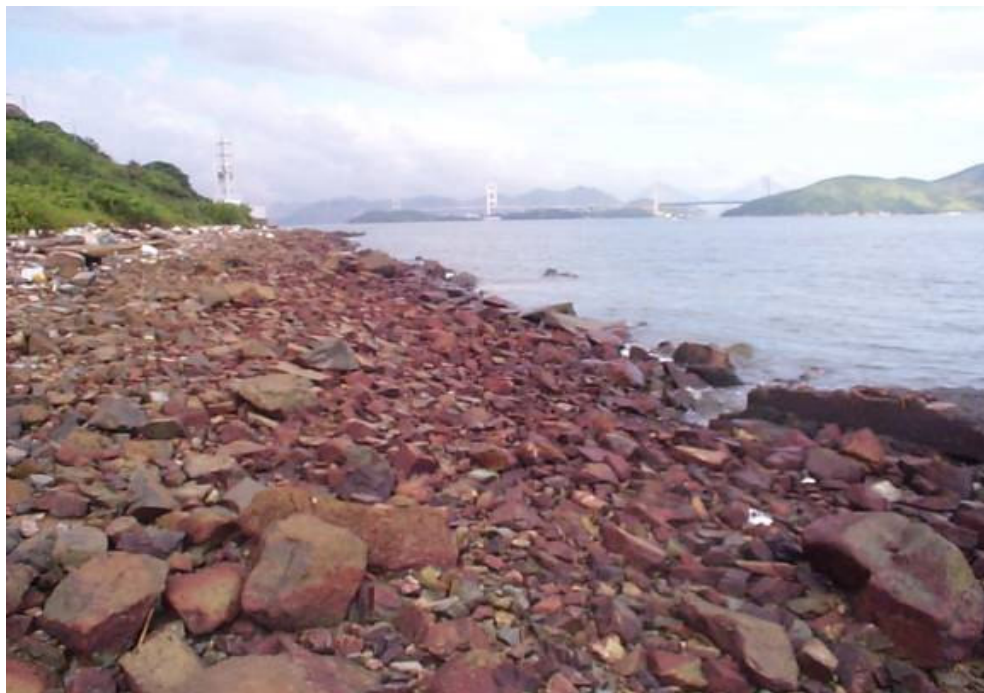
Natural Boulder Shore