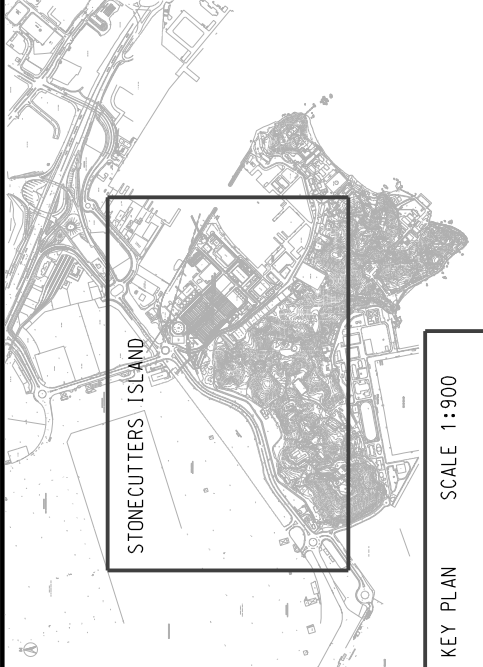
KEY PLAN SCALE 1:900