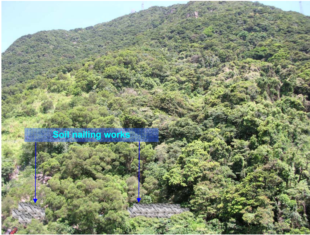
DAY 1 WITHOUT MITIGATION