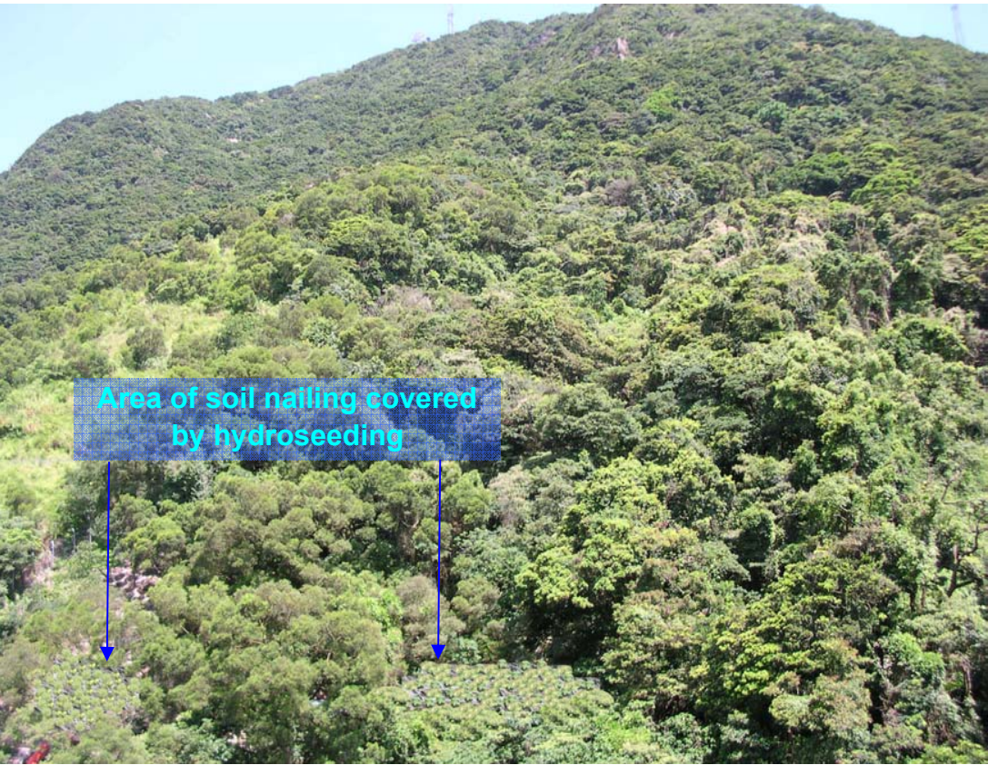
DAY 1 WITH MITIGATION