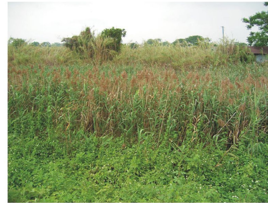
65. LR076 - Fishpond west of Palm Springs