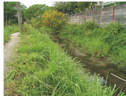
71. LR083 - Stream west of Palm Springs