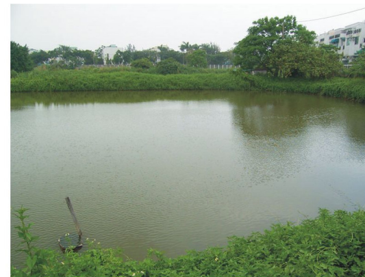
68. LR080 - Trees beside fishponds west of Palm Springs