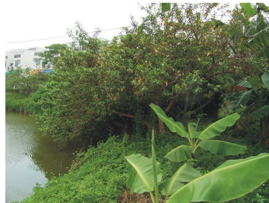
67. LR079 - Fishponds west of Palm Springs