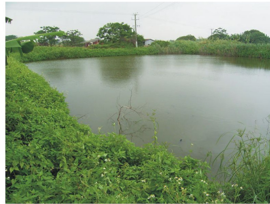
64. LR075 - Fishponds west of Palm Springs