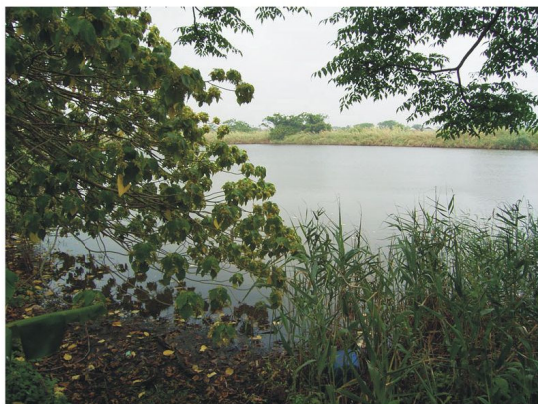
69. LR081 - Fishponds west of Palm Springs