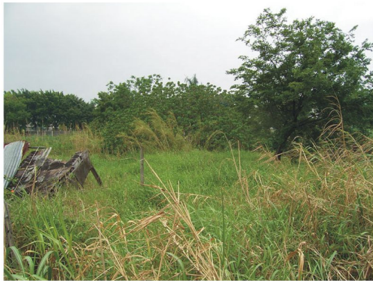
63. LR074 - Trees beside fishponds west of Palm Springs