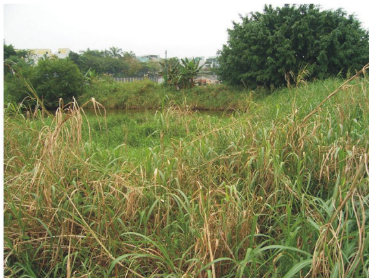
66. LR077 - Fishponds west of Palm Springs; LR078 - Trees beside fishponds west of Palm Springs