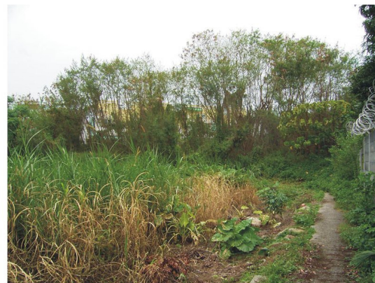
70. LR082 - Trees beside fishponds west of Palm Springs