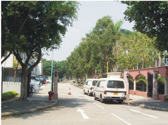
76. LR088 - Trees in southern Palm Springs