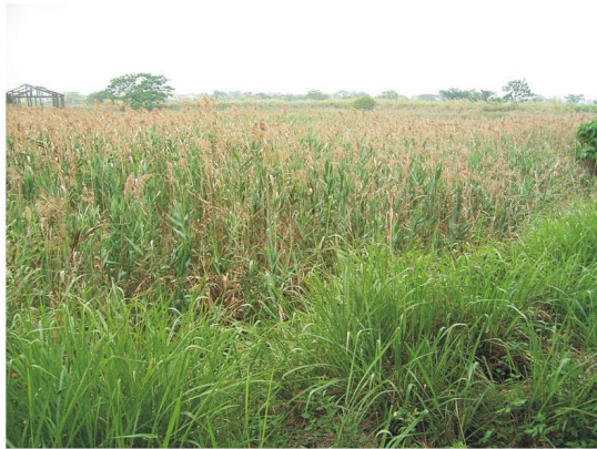
72. LR084 - Fishponds west of Palm Springs