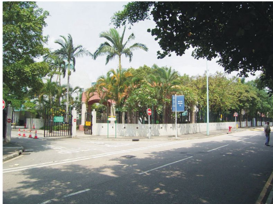
75. LR087 - Trees in western Palm Springs