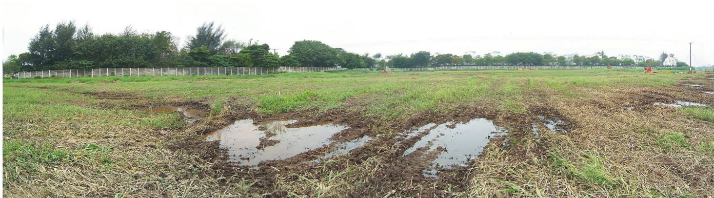
74. LR086 - Trees in northern Palm Springs