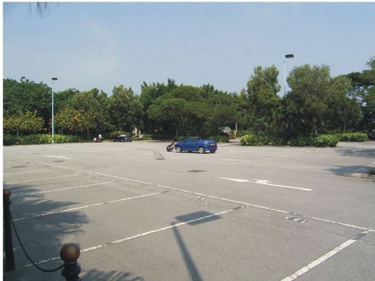
77. LR089 - Trees in car park in Palm Springs