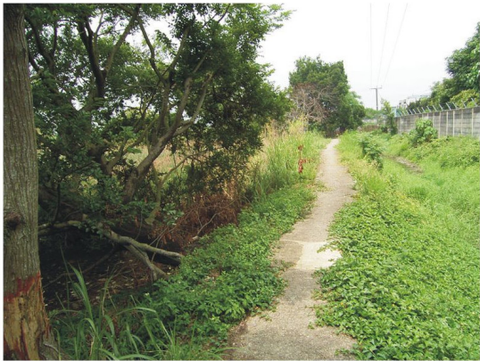
73. LR085 - Trees beside fishponds west of Palm Springs