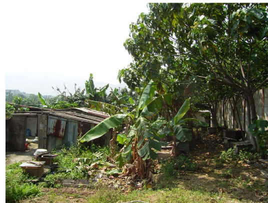
82. LR094 - Trees beside ponds in Palm Springs