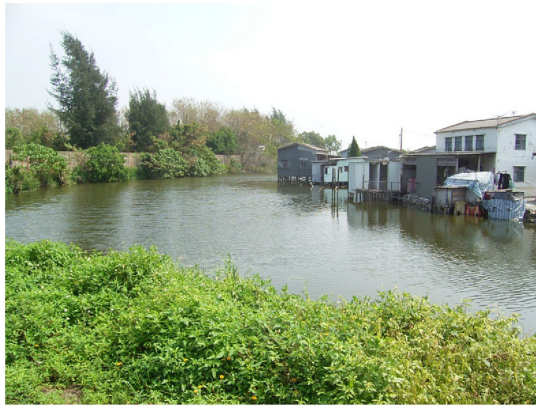
78. LR090 - Pond in Wo Shang Wai Village