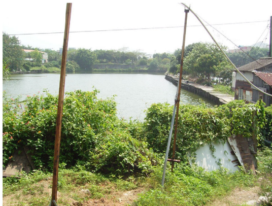
81. LR093 - Ponds in Palm Springs