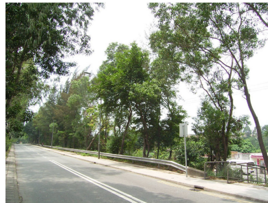
85. LR097 - Trees east of Royal Palms