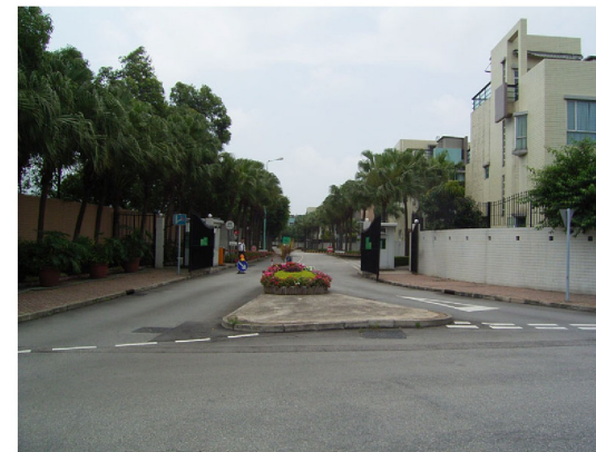
83. LR095 - Trees in southern of Royal Palms