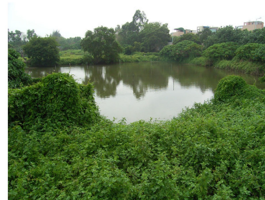
86. LR098 - Pond south of Palm Springs Boulevard entrance