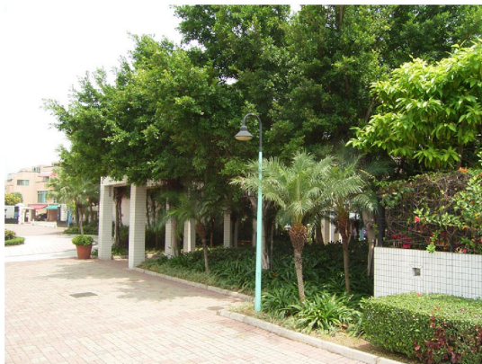
84. LR096 - Trees around sports facilities in Royal Palms