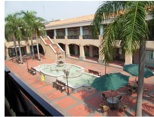
80. LR092 - Trees at Shopping Mall in Palm Springs