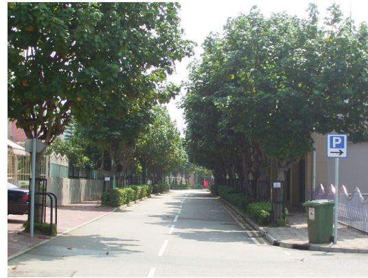
79. LR091 - Trees in northern Palm Springs