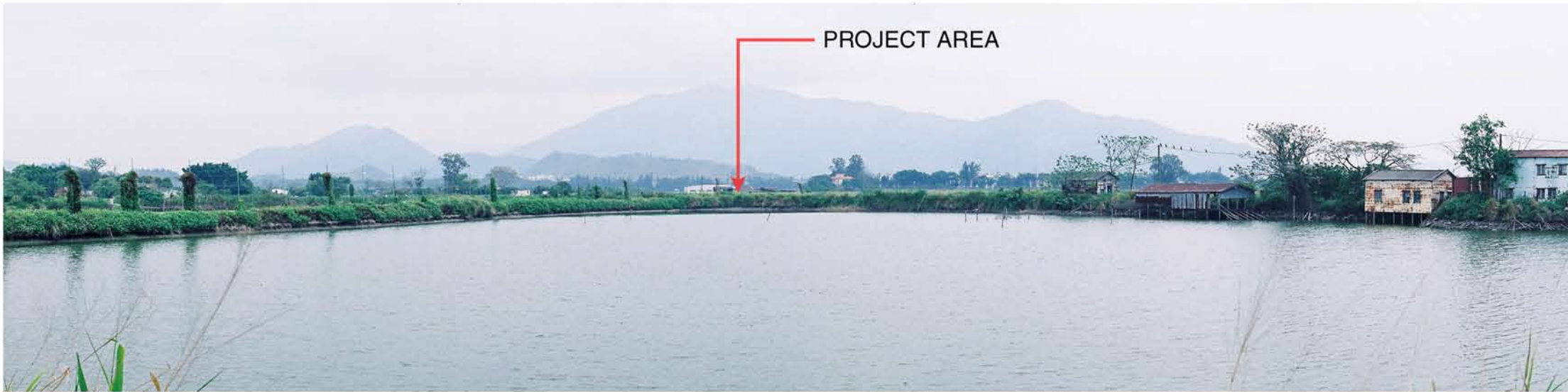
Viewpoint No.14 - Existing View from Mai Po Nature Reserve