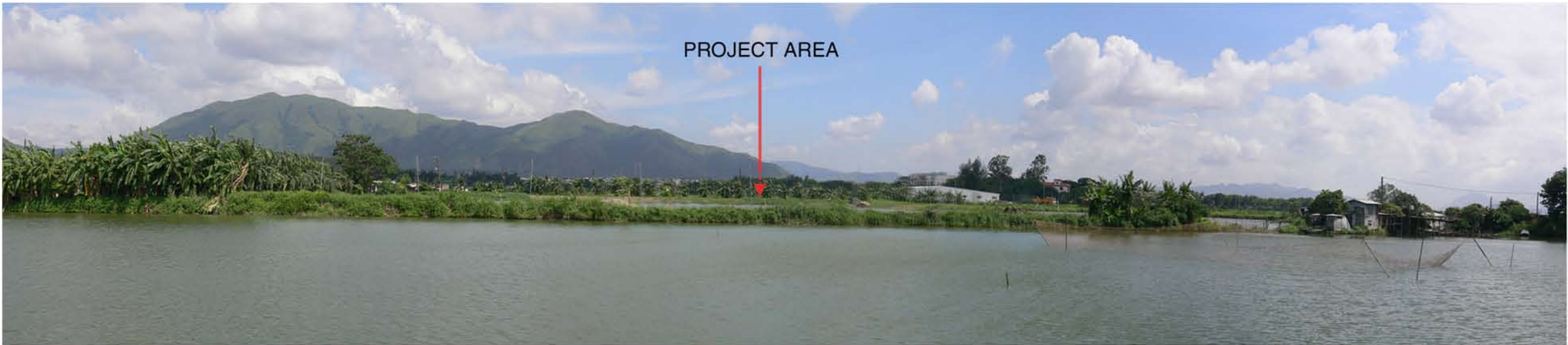
Viewpoint No.13 - View of Residents in Tam Kon Chau (R6)