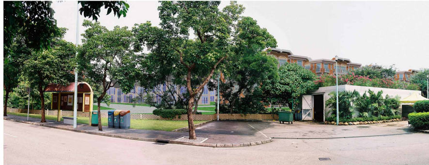
View from Palm Springs Boulevard at Day 1 without Mitigation