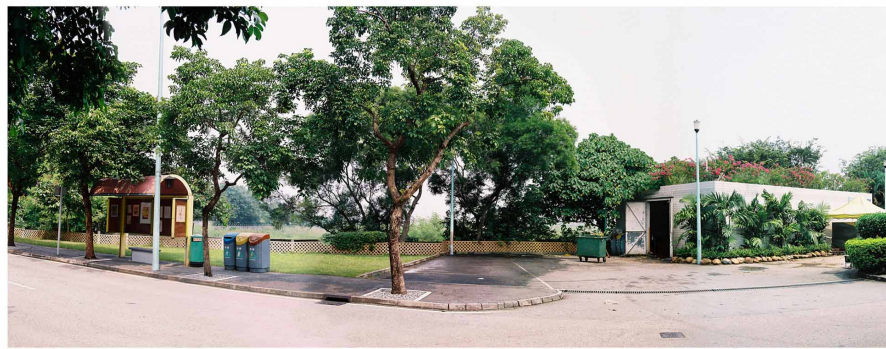
Existing View from Palm Springs Boulevard, Palm Springs