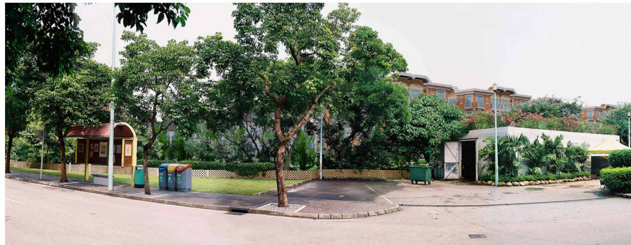
View from Palm Springs Boulevard at Day 1 with Mitigation