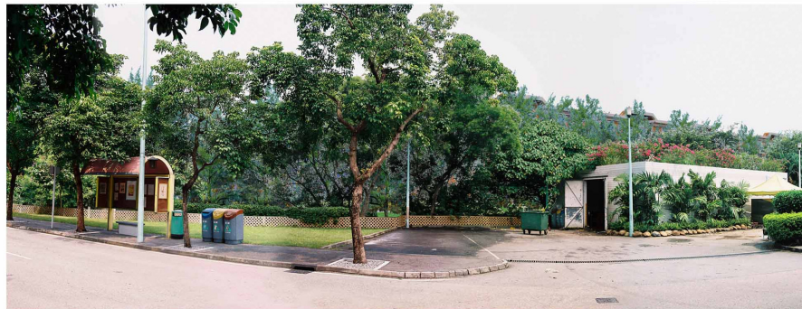
View from Palm Springs Boulevard at Year 10 with Mitigation