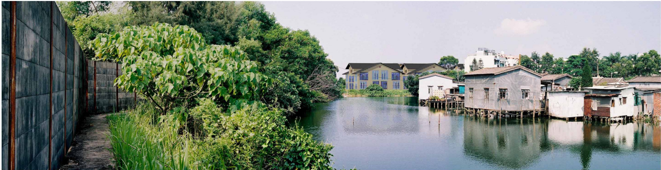
View from Wo Shang Wai Village at Day 1 without Mitigation