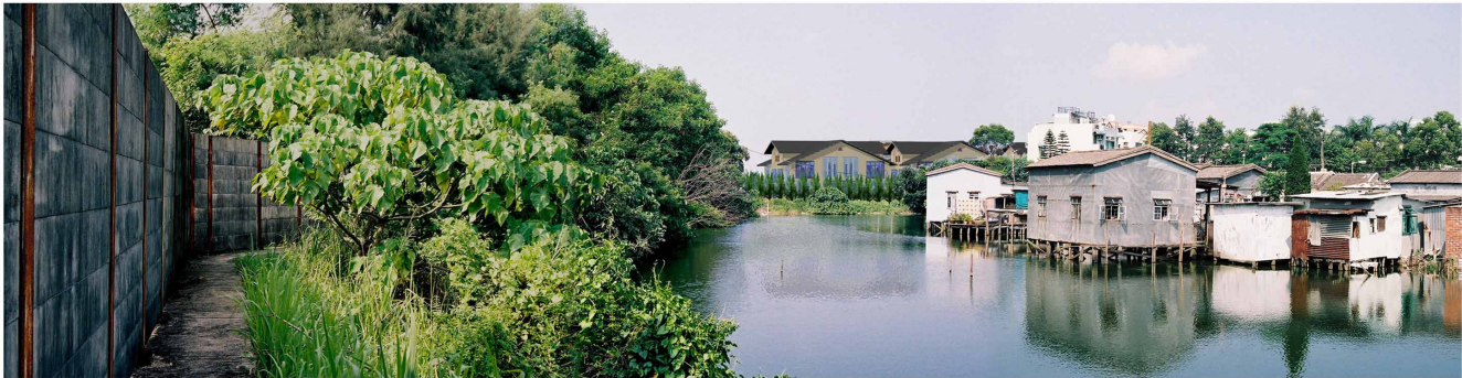
View from Wo Shang Wai Village at Day 1 with Mitigation