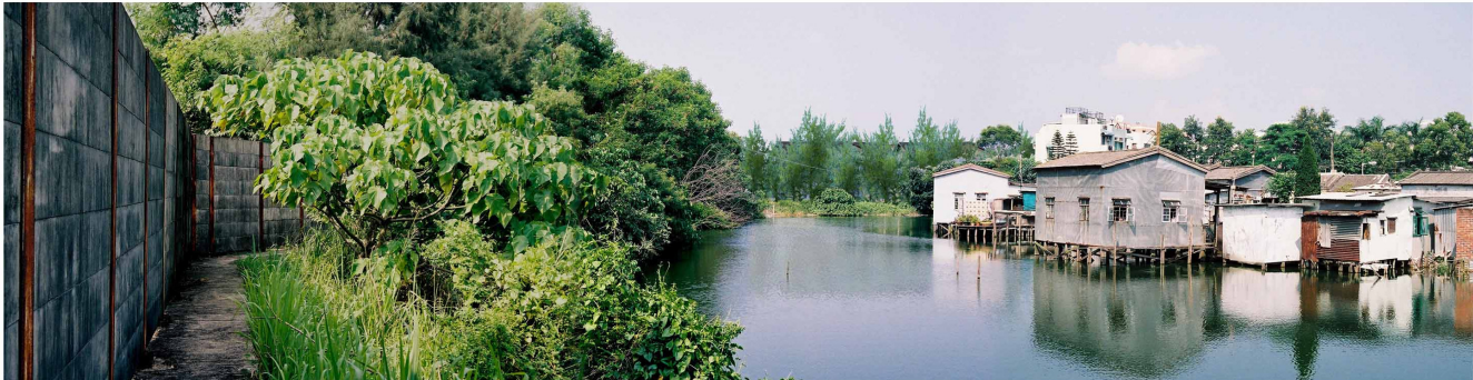
View from Wo Shang Wai Village at Year 10 with Mitigation