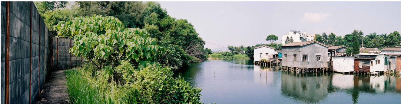
Existing View from Wo Shang Wai Village