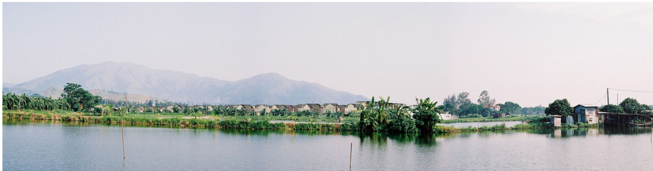
View from Tam Kon Chau Village at Day 1 without Mitigation