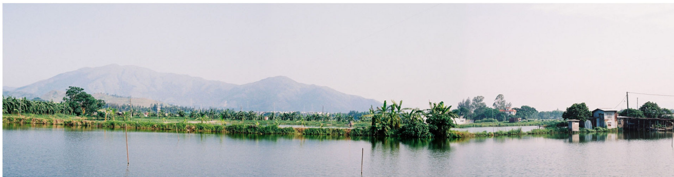
Existing View from Tam Kon Chau Village