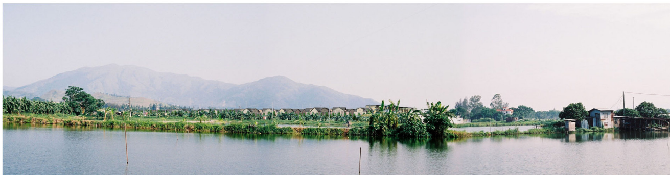
View from Tam Kon Chau Village at Day 1 with Mitigation