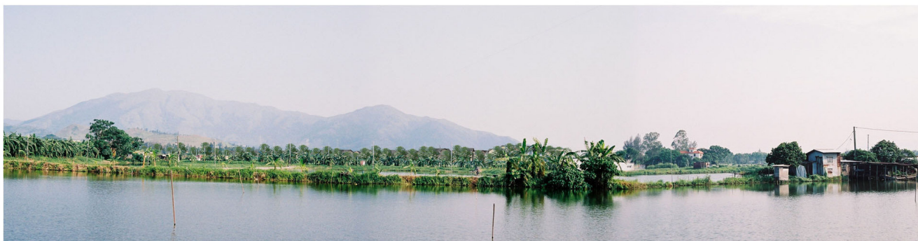
View from Tam Kon Chau Village at Year 10 with Mitigation