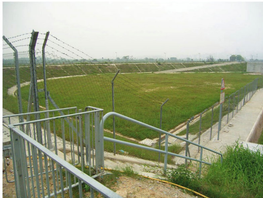
39. LR042 - Grassland besides DSD building