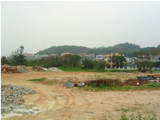
41. LR044 - Trees behind Mai Po San Tsuen