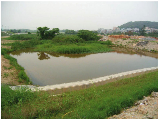
38. LR041 - Pond behind Mai Po San Tsuen