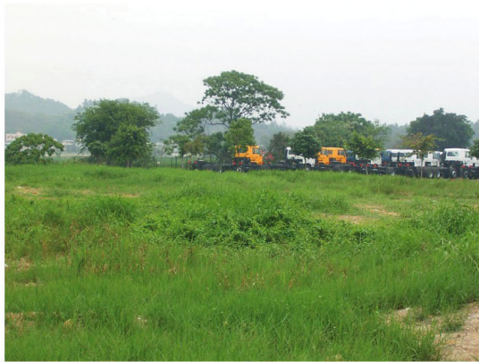
33. LR036 - Trees inside open storage area (on-site)