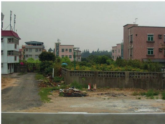
37. LR040 - Trees in cottage area east of Castle Peak Road