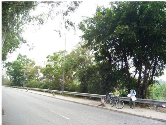
36. LR039 - Trees along Castle Peak Road (Mai Po) (on-site)