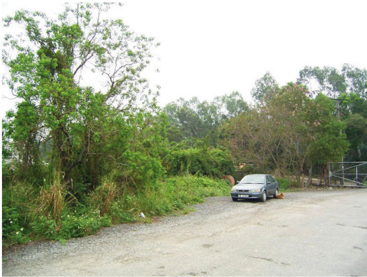
35. LR038 - Trees inside open storage area