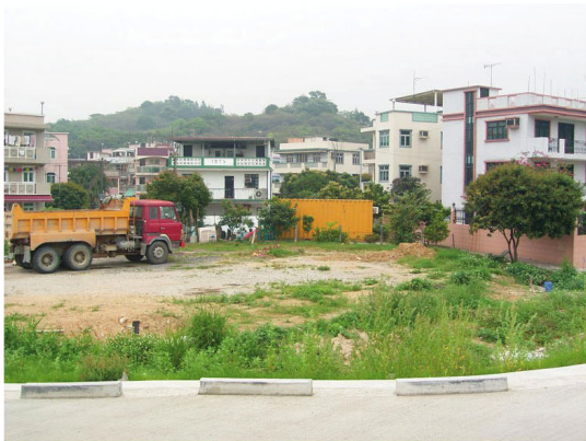
40. LR043 - Trees in Mai Po San Tsuen