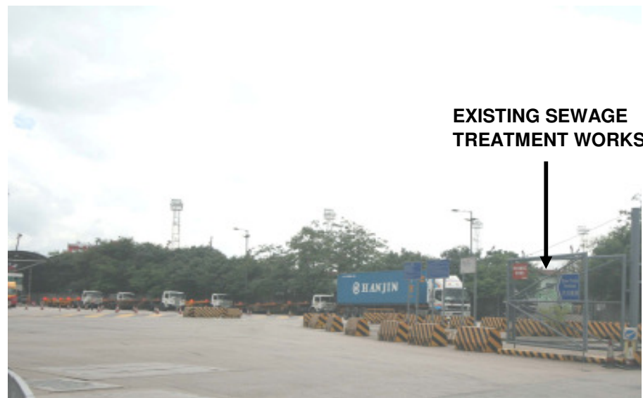
V1 - VIEW FROM RIVER TRADE TERMINAL