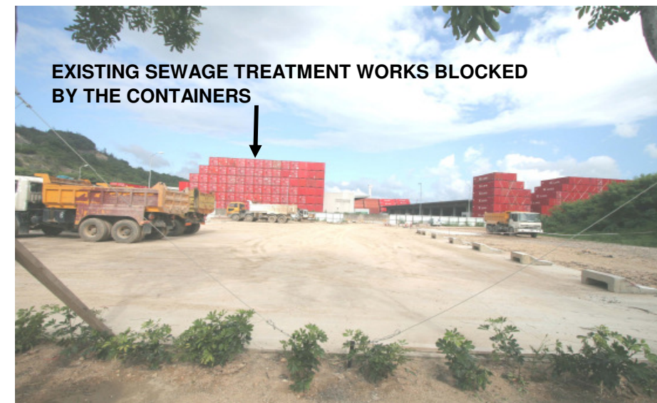
V3 - VIEW FROM PLANNED DEVELOPMENT IN TUEN MUN AREA 38