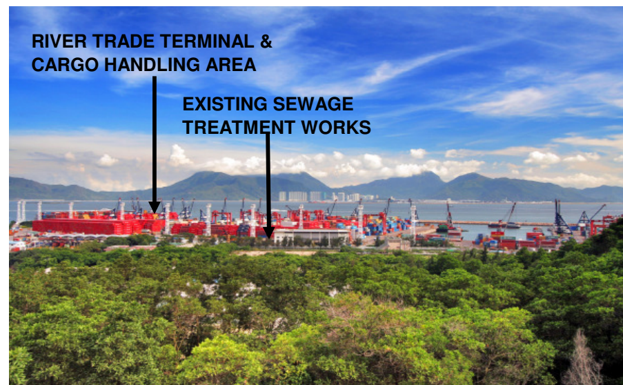
V4 - VIEW FROM THE ROAD NEXT THE EMSD TUEN MUN VEHICLE SERVICING STATION