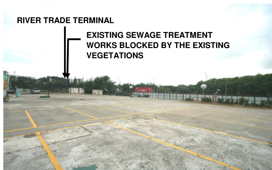
V2 - VIEW FROM RIVER TRADE GOLF COURSE