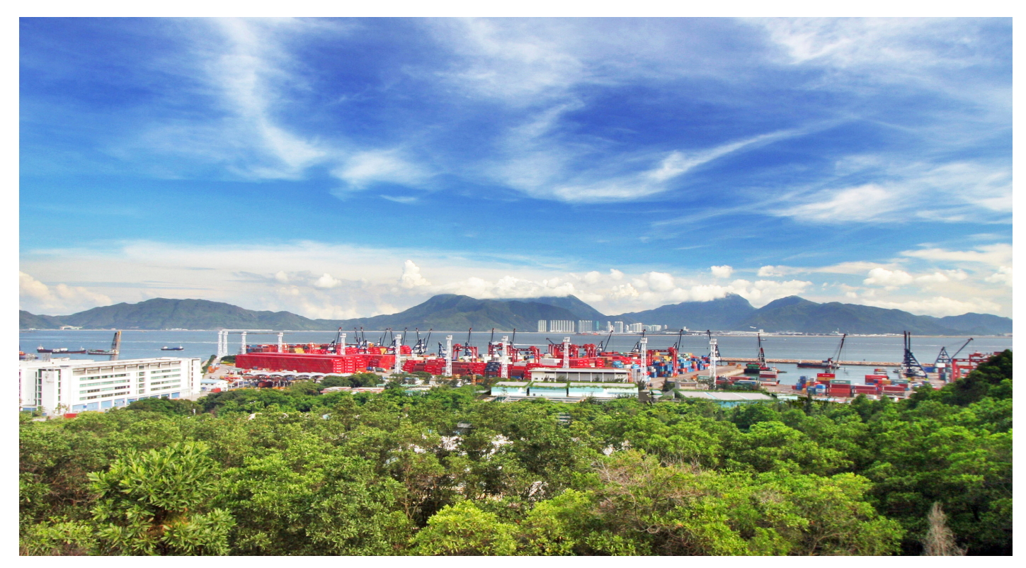
WITH MITIGATION MEASURE AT OPERATION DAY 1