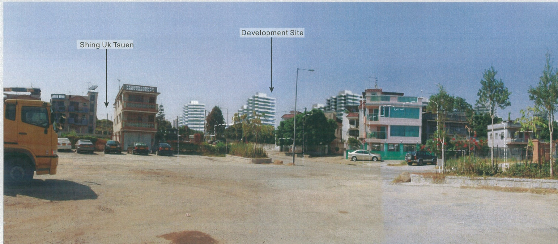
Year 10 of Operational Phase with landscape mitigation measures fully established