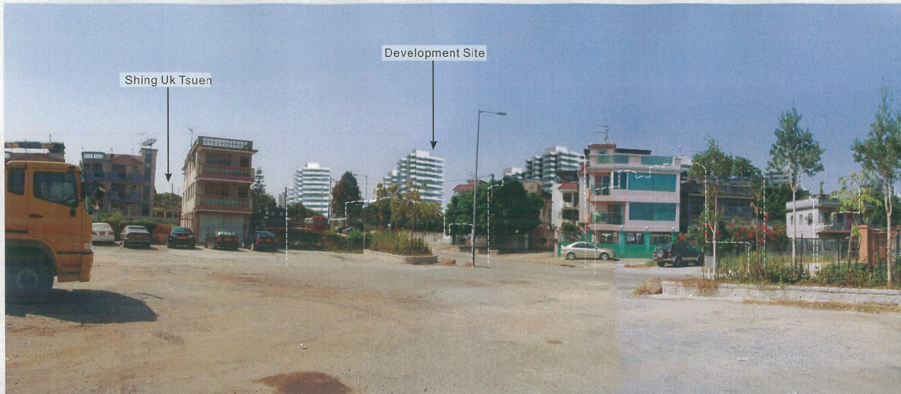
Year 1 of Operation Phase with landscape mitigation measures