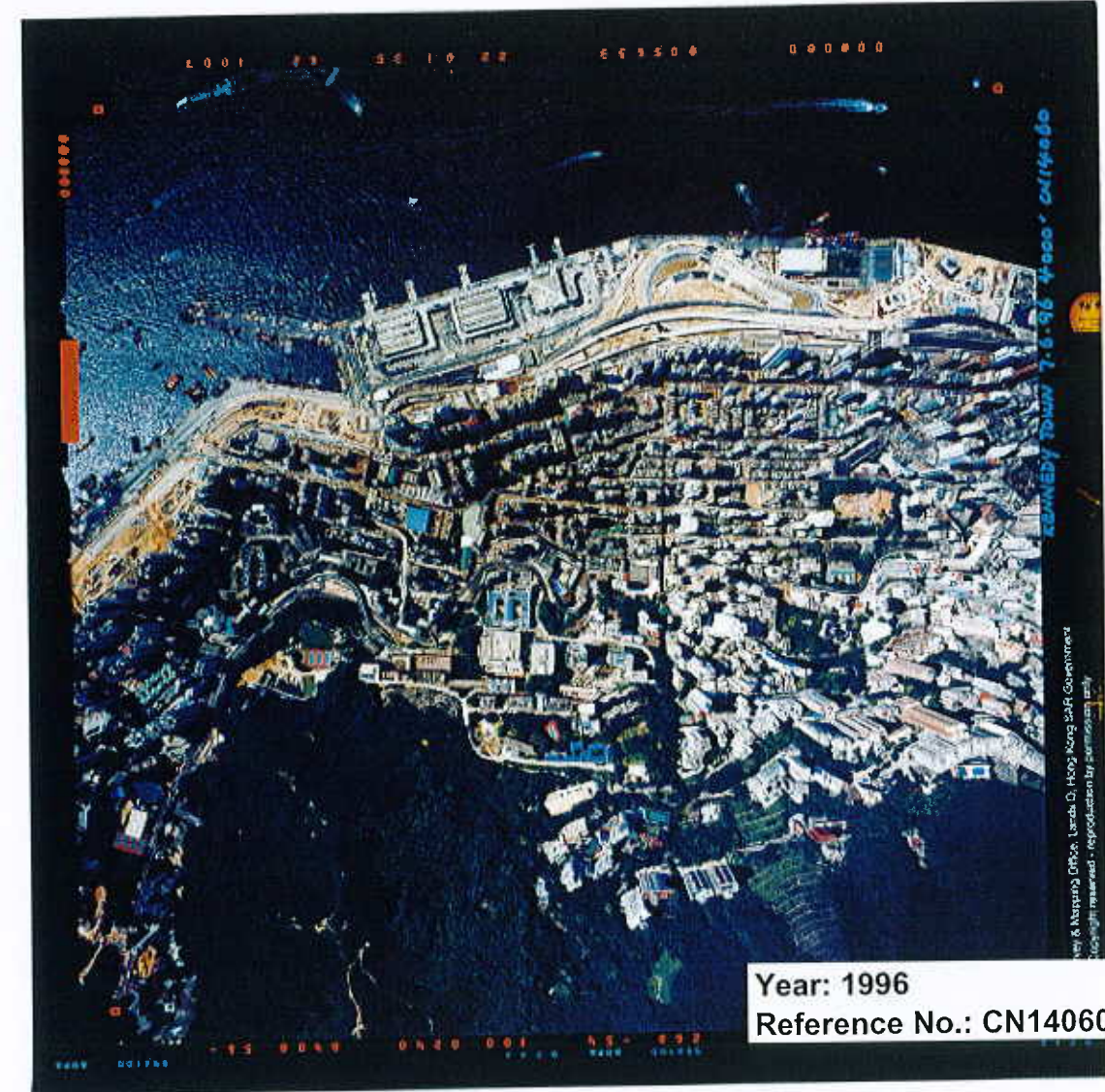
Year: 1996 Reference No.: CN14060