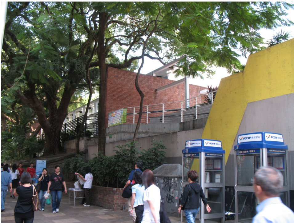
Plate 4: View of the south-eastern corner of Block S4 taken from corner of Nathan Road and Haiphong Road (looking northwest)