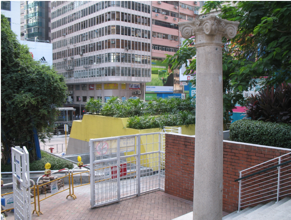
Plate 1: Existing view from the entrance of Block S4 (looking southeast)