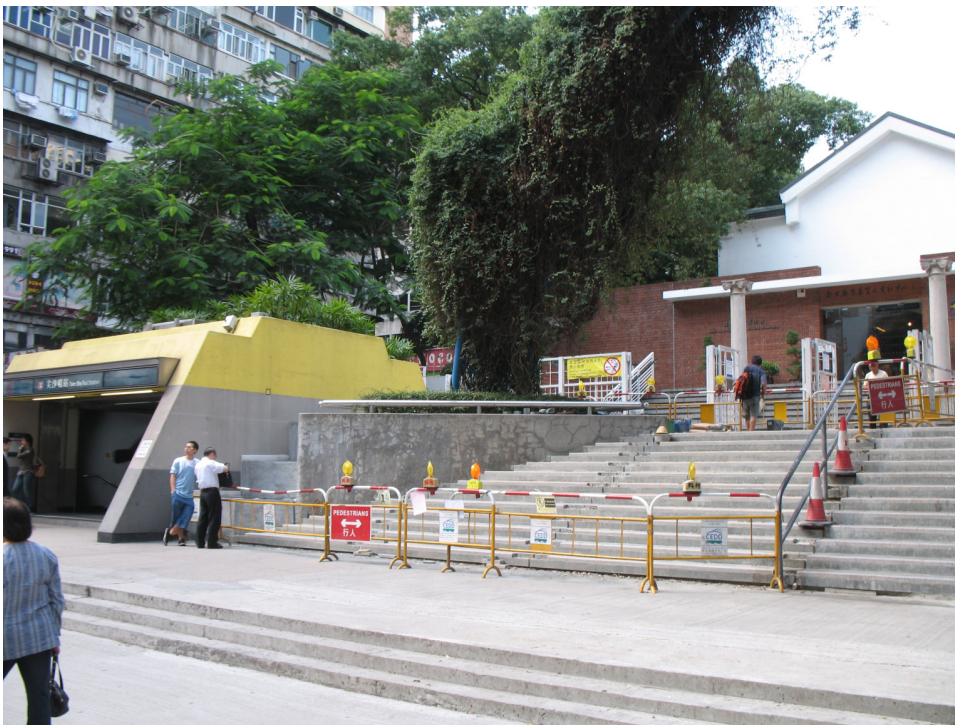
Plate 2: Existing view of the modern entrance of Block S4 and the existing MTR Entrance A1 (looking west northwest)