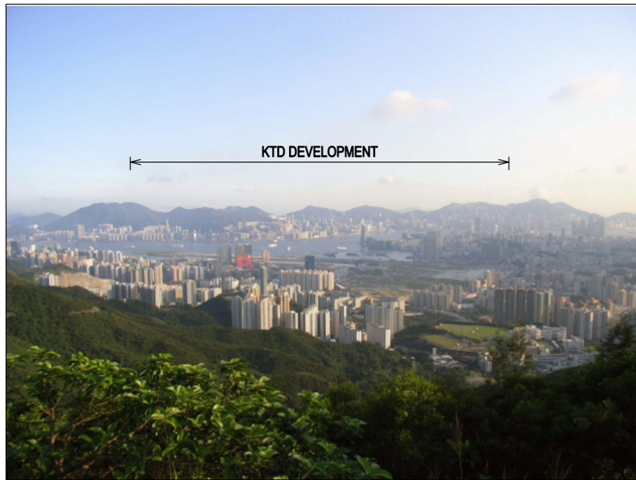
PHOTO E6 FROM KOWLOON PEAK