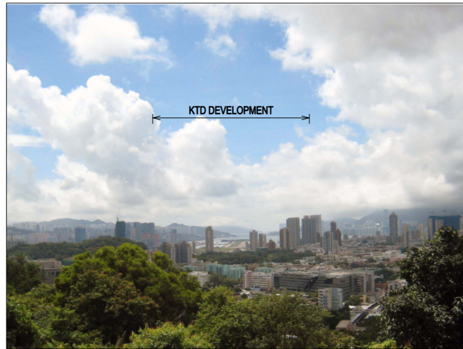
PHOTO E7 FROM LUNG CHEUNG ROAD LOOKOUT