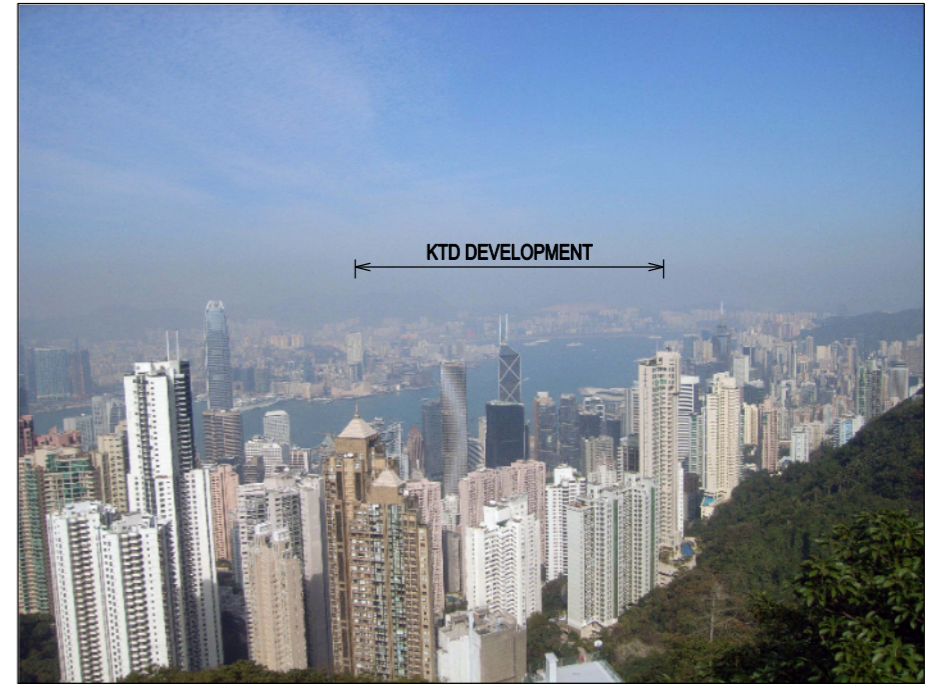
PHOTO E5 FROM THE PEAK