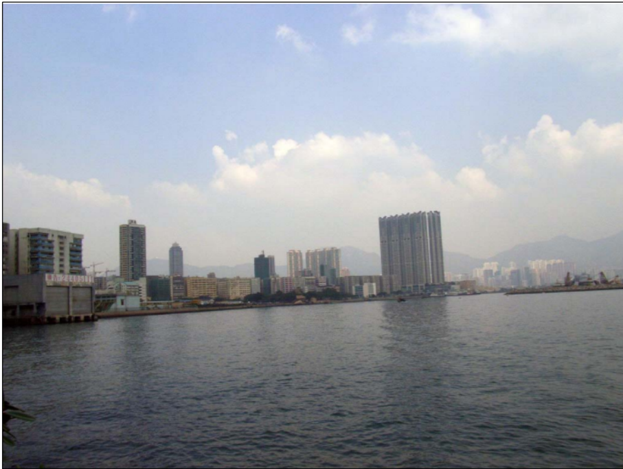
PHOTO B04 - LCA02 KOWLOON CITY AND TO KWA WAN CITY GRID MIXED URBAN LANDSCAPE