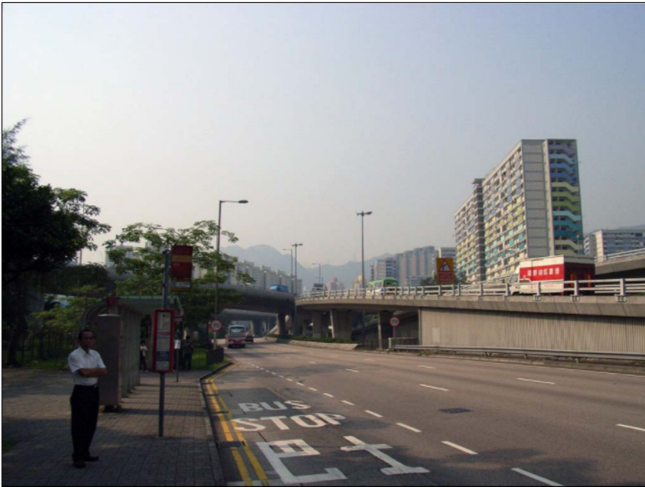
PHOTO B08 - LCA06 KOWLOON CITY AND CHOI HUNG RESIDENTIAL URBAN LANDSCAPE