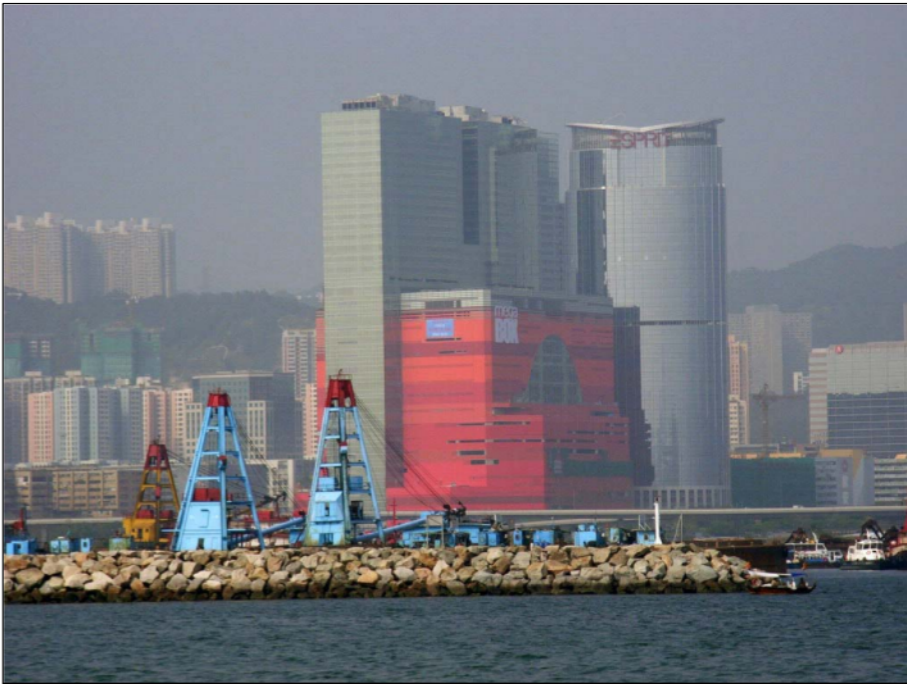
PHOTO B15 - LCA09 TO KWA WAN TYPHOON SHELTER LANDSCAPE