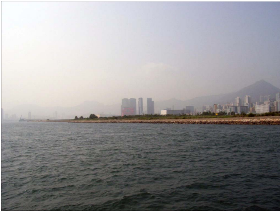
PHOTO B01 - LCA01 FORMER KAI TAK AIRPORT LANDSCAPE