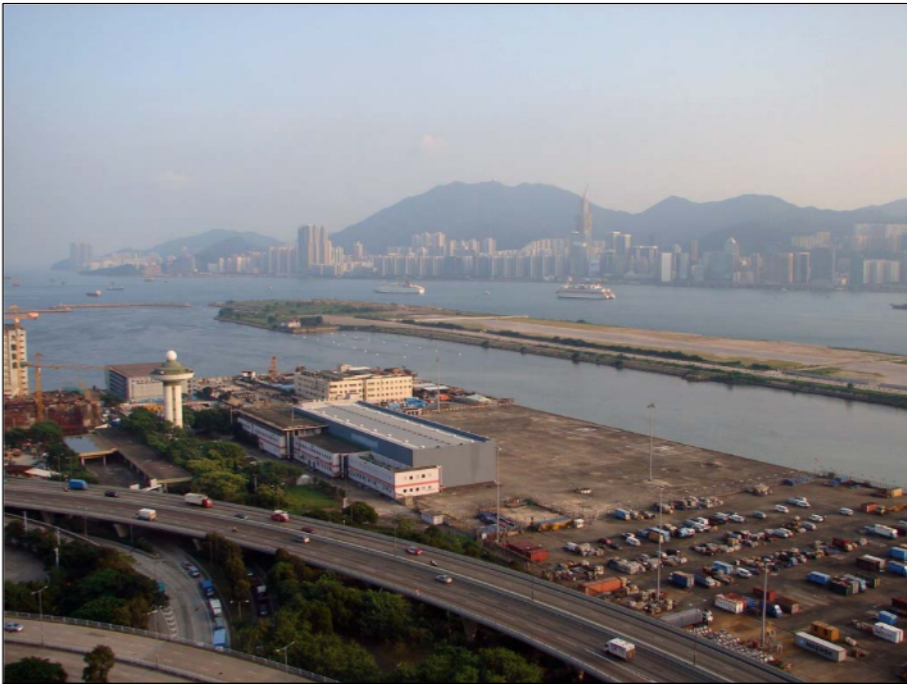
PHOTO B03 - LCA01 FORMER KAI TAK AIRPORT LANDSCAPE