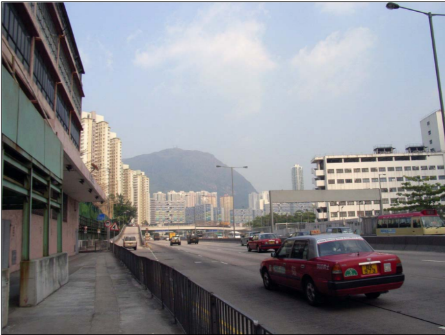
PHOTO B09 - LCA06 KOWLOON CITY AND CHOI HUNG RESIDENTIAL URBAN LANDSCAPE