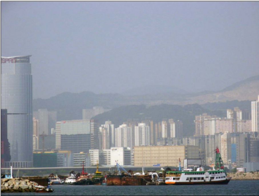
PHOTO B14 - LCA09 TO KWA WAN TYPHOON SHELTER LANDSCAPE