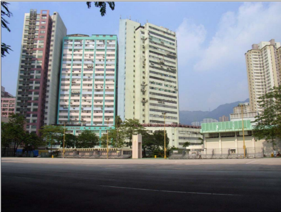
PHOTO B06 - LCA04 SAN PO KONG INDUSTRIAL URBAN LANDSCAPE