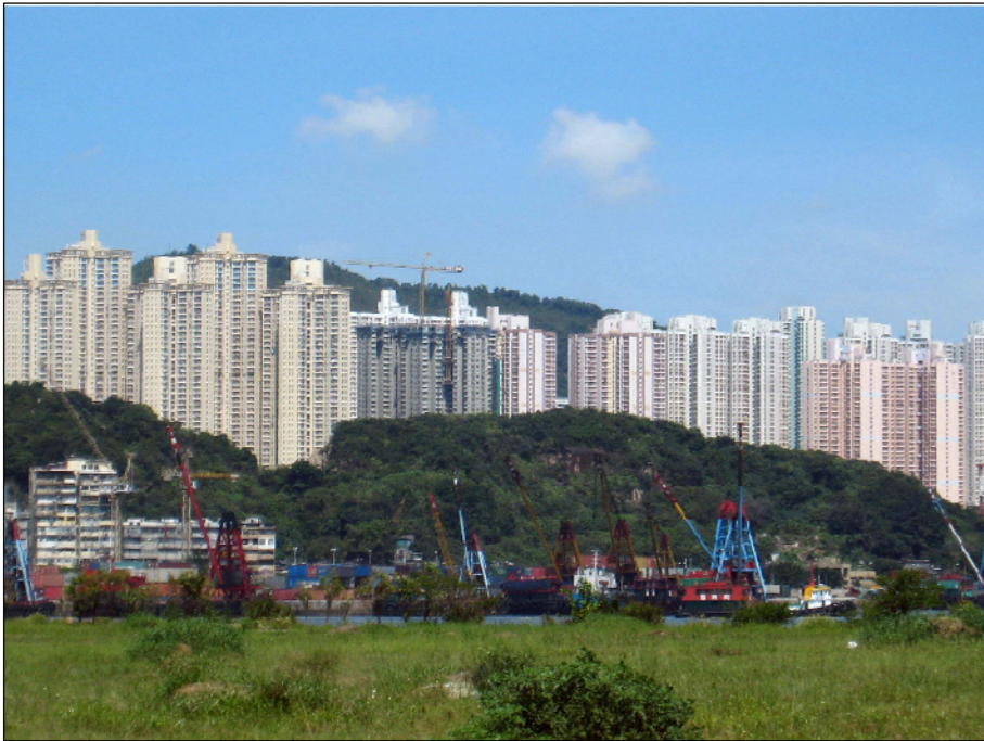
PHOTO B16 - LCA10 CHA KO LING MISCELLANEOUS URBAN FRINGE LANDSCAPE