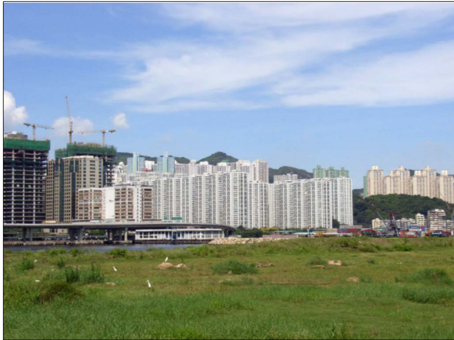
PHOTO B10 - LCA07 LAGUNA CITY AND YAU TONG RESIDENTIAL URBAN LANDSCAPE