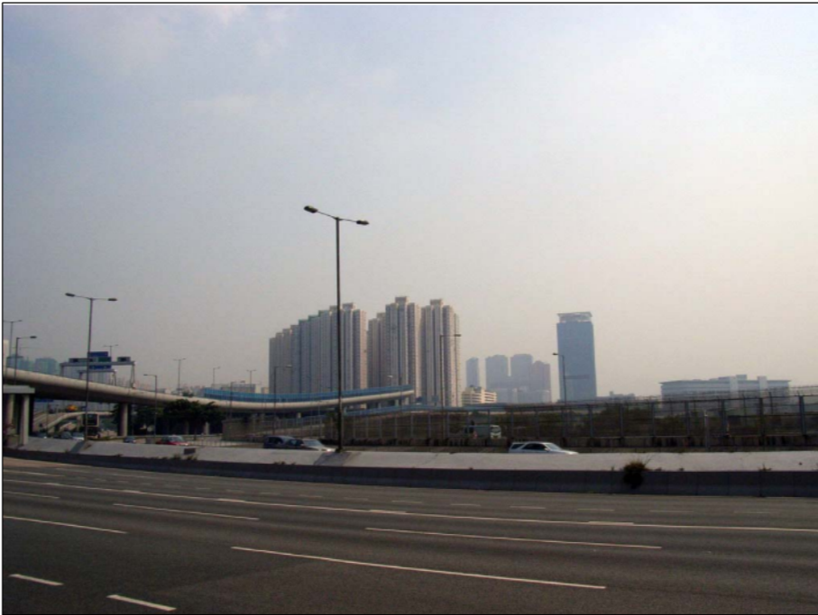
PHOTO B05 - LCA03 KWOLOON BAY LATE 20C EARLY 21C COMMERCIAL RESIDENTIAL COMPLEX LANDSCAPE