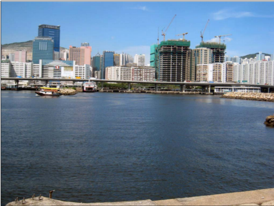
PHOTO B11 - LCA08 KWUN TONG TYPHOON SHELTER LANDSCAPE