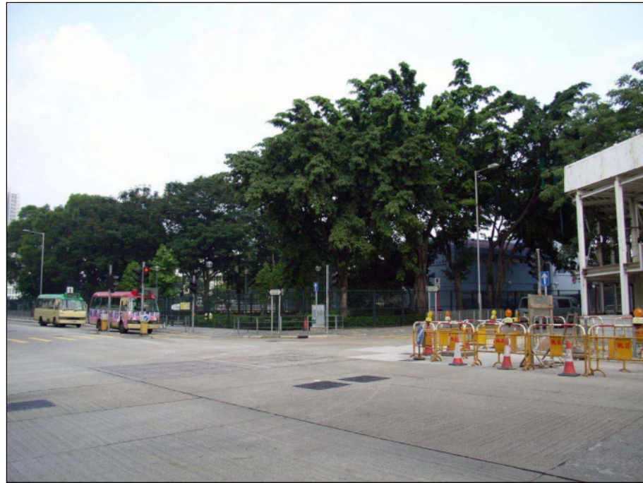
PHOTO C19 - 05 VISITORS AT SHEK KU LUNG ROAD PLAYGROUND