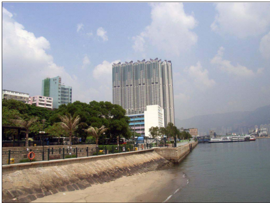
PHOTO C21 - 07 VISITORS AT KING WAN STREET PLAYGROUND