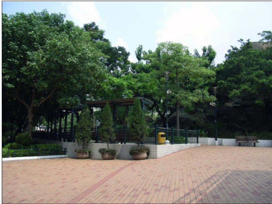
PHOTO C27 - O13 VISITORS AT HOI SHAM PARK