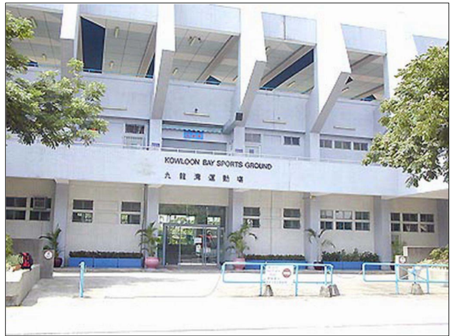
PHOTO C23 - 09 VISITORS AT KOWLOON BAY SPORTS GROUND