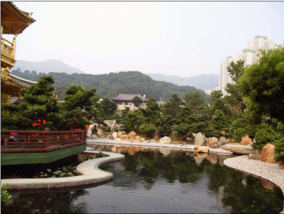
PHOTO C25 - O11 VISITORS AT NAN LIAN GARDEN AND CHI LIN NUNNERY