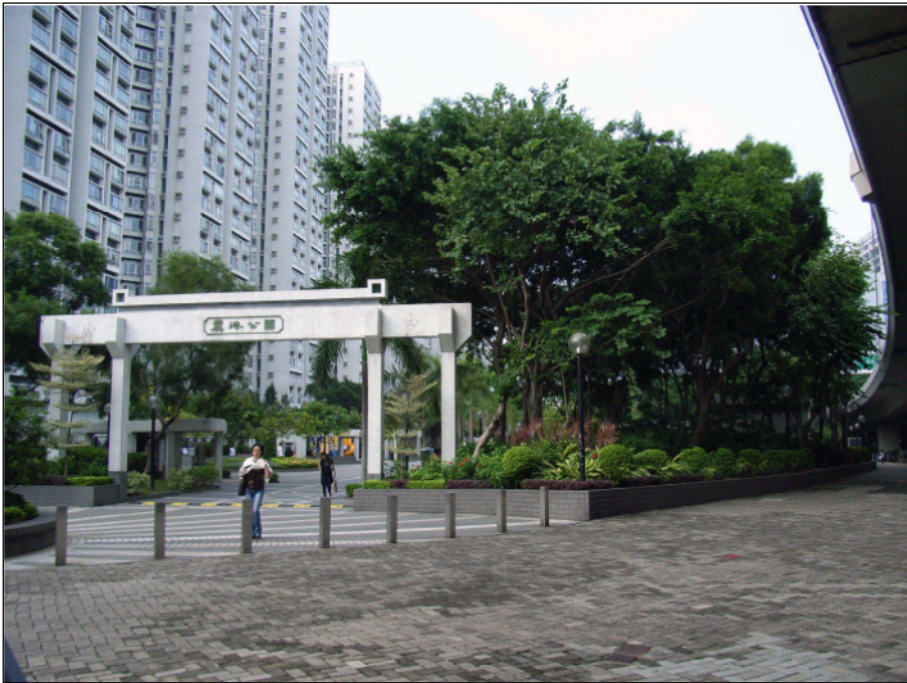
PHOTO C29 - O15 VISITORS AT LAGUNA PARK