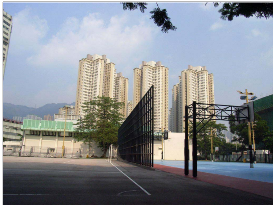
PHOTO C22 - 08 VISITORS AT KAI TAK EAST PLAYGROUND