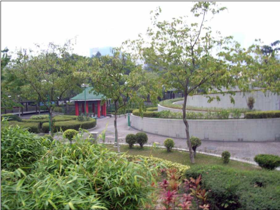
PHOTO C28 - O14 VISITORS HOI BUN ROAD PARK