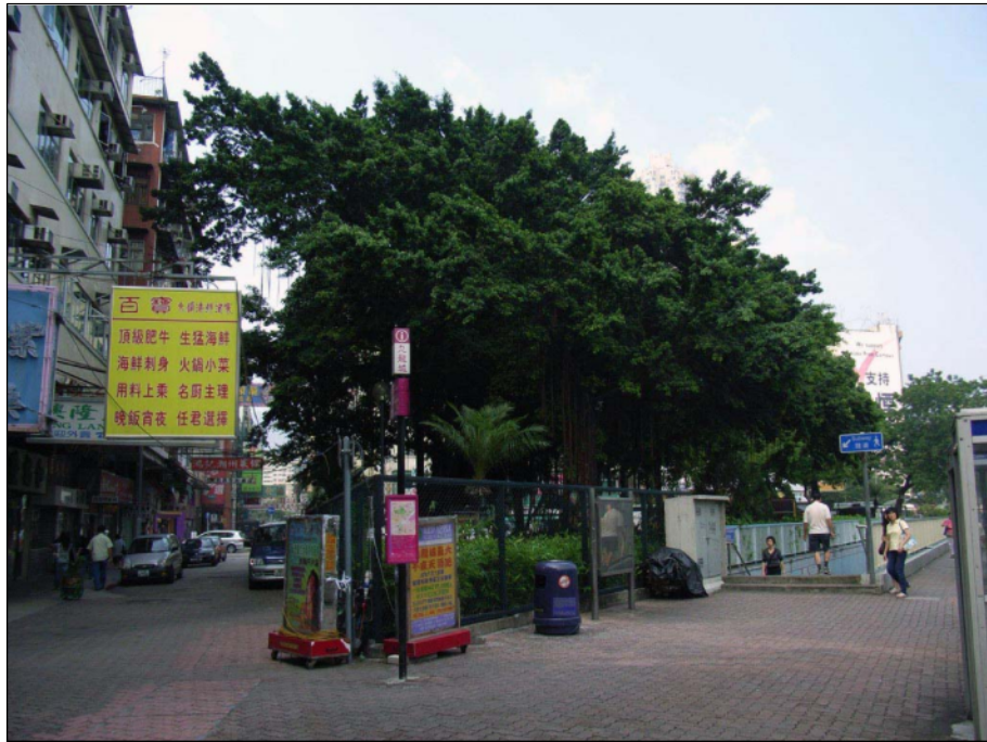
PHOTO C18 - 04 VISITORS AT REST GARDEN NEXT TO NGA TSIN WAI ROAD