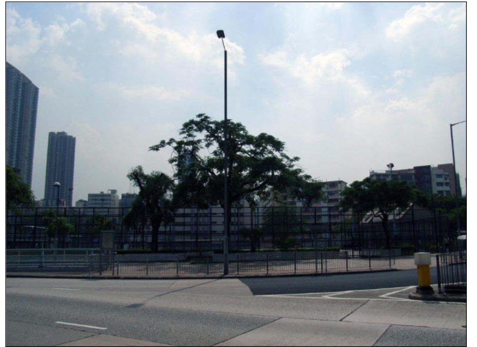
PHOTO C20 - 06 VISITORS AT ARGYLE STREET PLAYGROUND