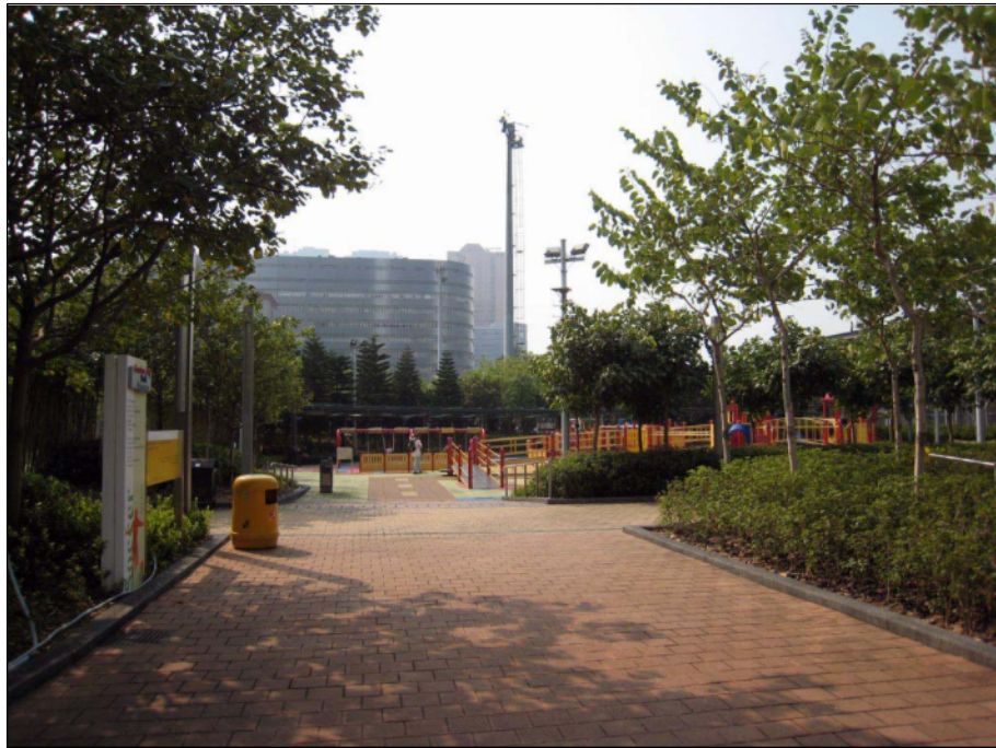
PHOTO C24 - O10 VISITORS KOWLOON BAY PARK