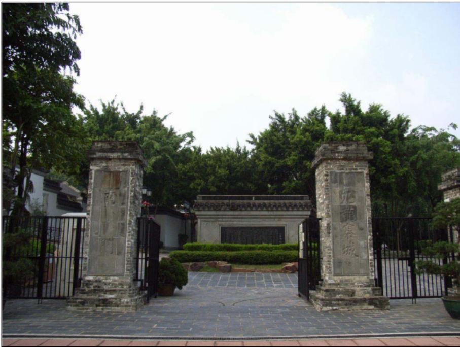
PHOTO C26 - O12 VISITORS AT KOWLOON WALLED CITY PARK