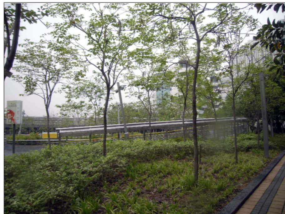
PHOTO D19 - O10 FROM KOWLOON BAY PARK