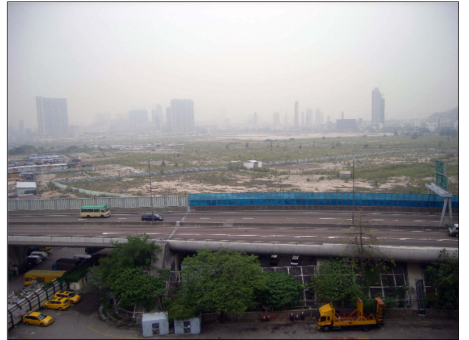
PHOTO D17 - R9 FROM RICHLAND GARDENS