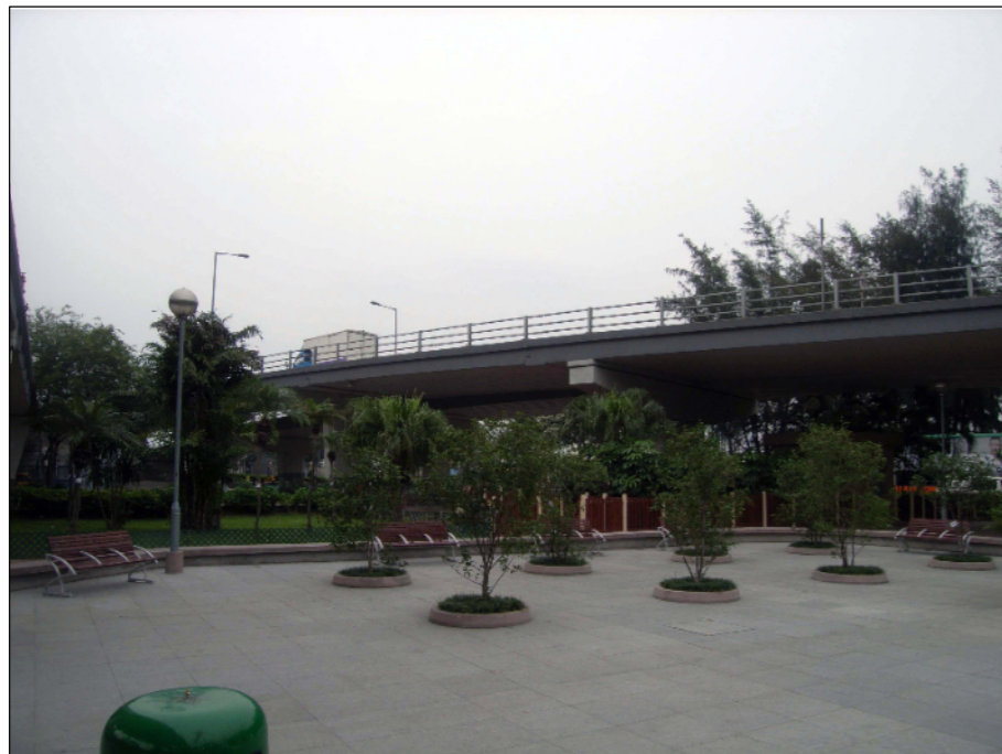
PHOTO D06 - O1 FROM OLYMPIC GARDEN