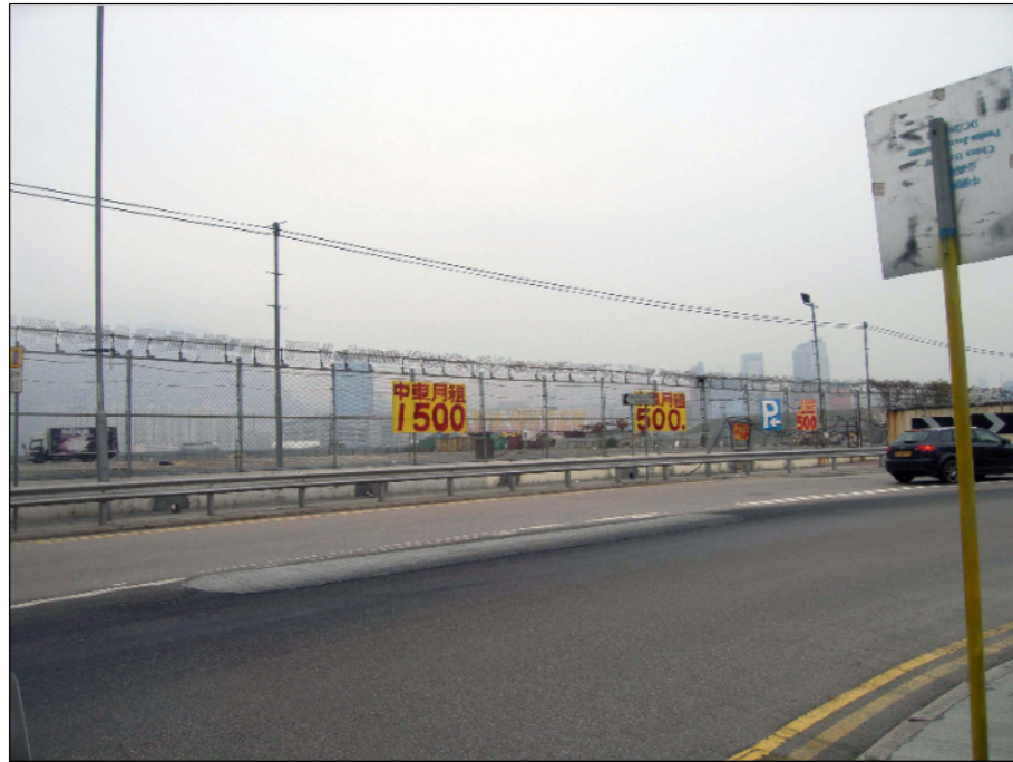
PHOTO D03 - T2 FROM SUNG WONG TOI ROAD