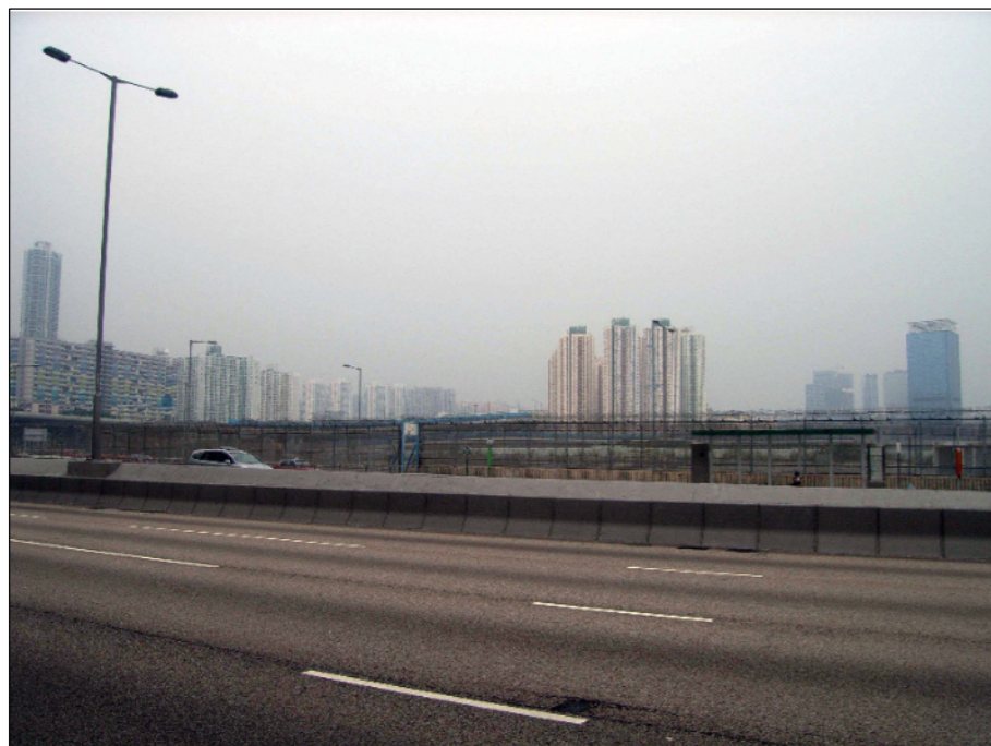
PHOTO D12 - 11 FROM INDUSTRIAL BUILDING FROM SAN PO KONG