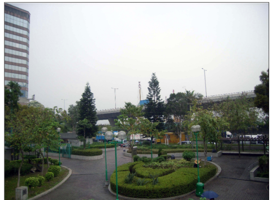
PHOTO D20 - O14 FROM HOI BUN ROAD PARK