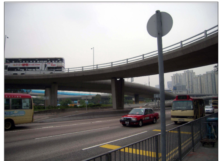
PHOTO D14 - R7 FROM CHOI HUNG ESTATE