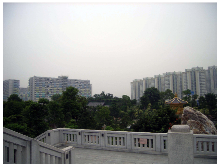
PHOTO D13 - 011 FROM CHI LIN NUNNERY