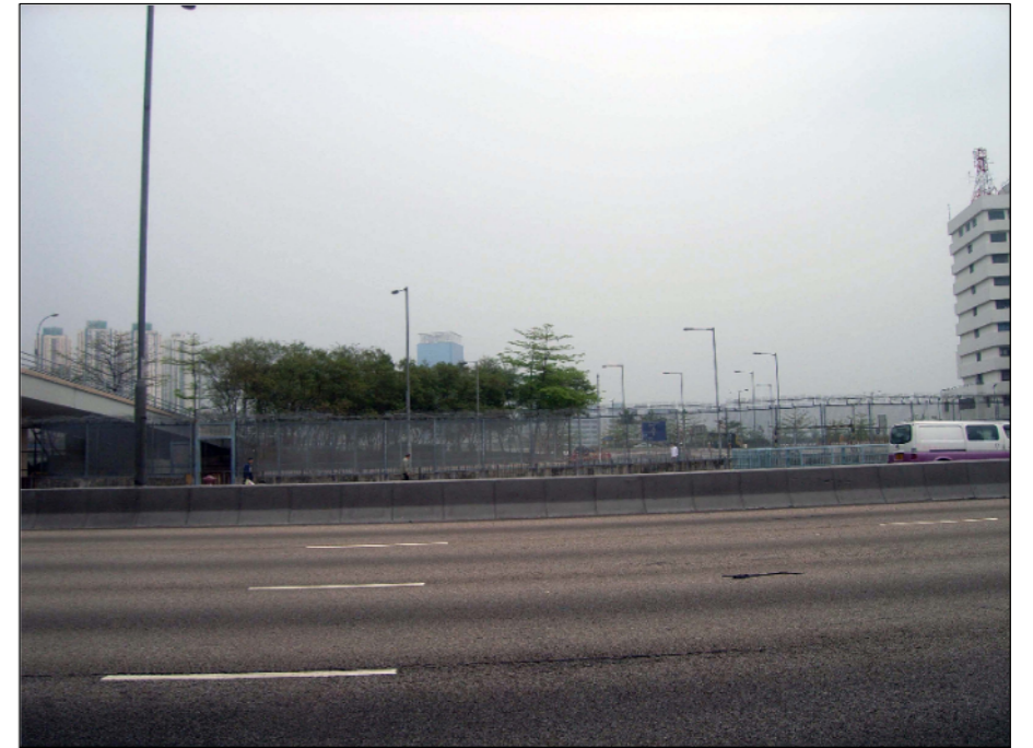
PHOTO D11 - 11 FROM INDUSTRIAL BUILDING IN SAN PO KONG