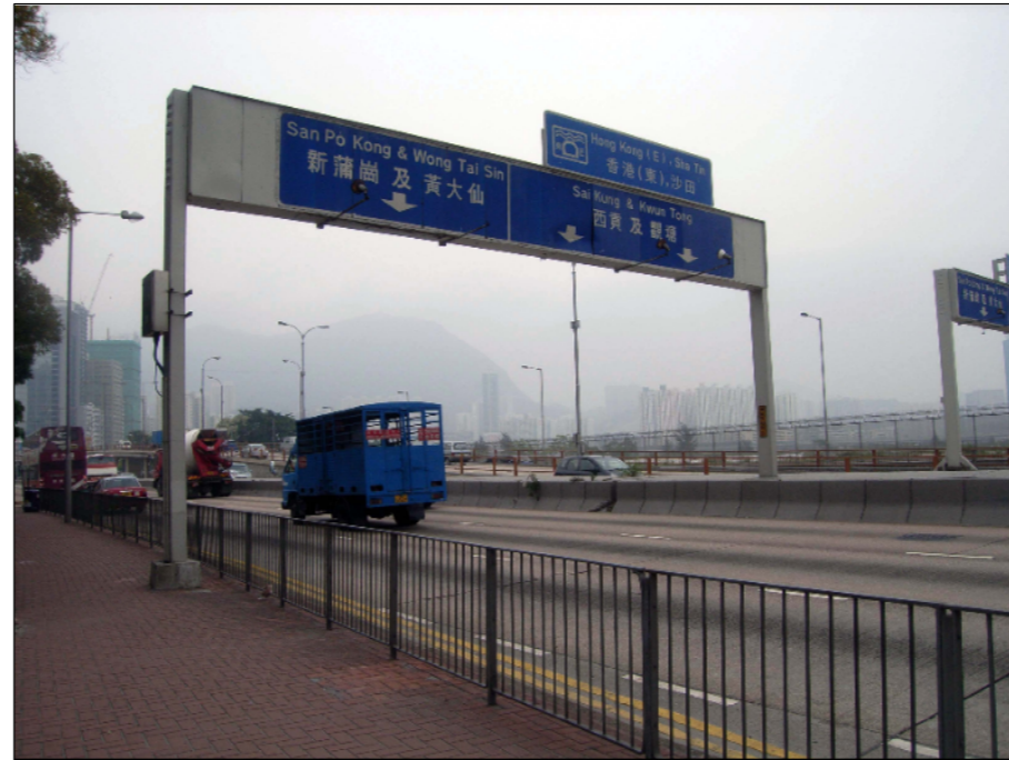
PHOTO D10 - 05 FROM SHEK KU LUNG ROAD PLAYGROUND