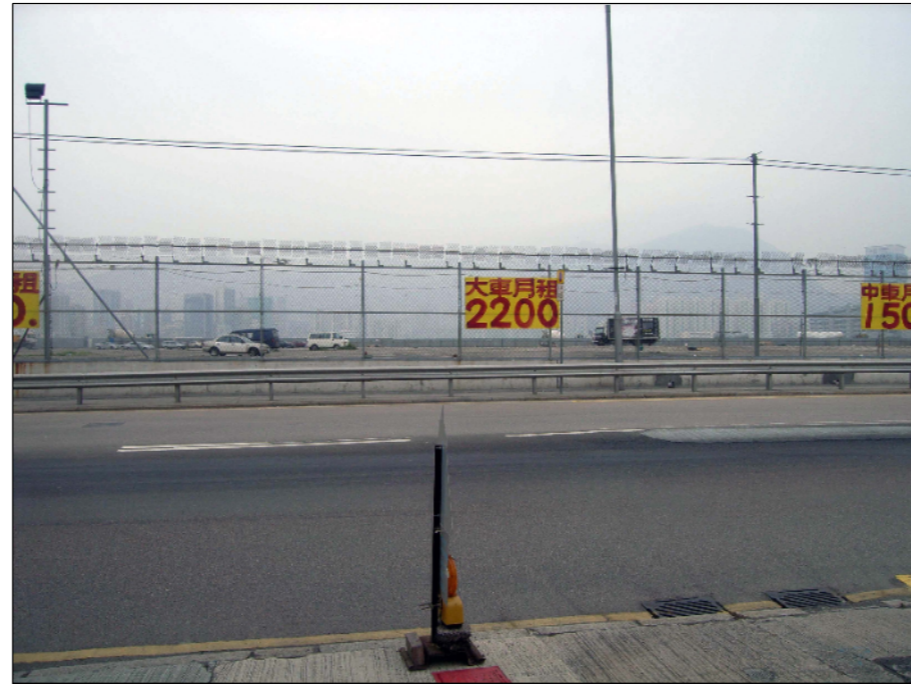
PHOTO D04 - T2 FROM SUNG WONG TOI ROAD