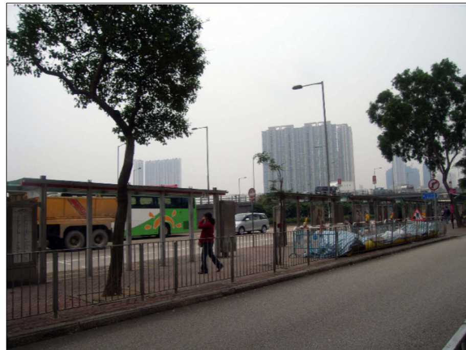
PHOTO D07 - R3 FROM LOW TO MEDIUM-RISE RESIDENTIAL DEVELOPMENT IN KOWLOON CITY