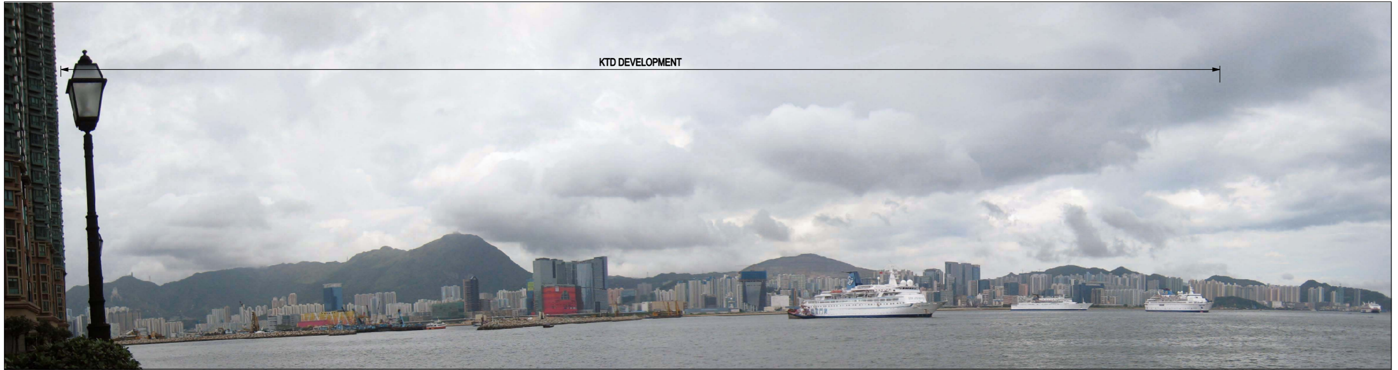
PHOTO D01 - R14 FROM LAGUNA VERDE