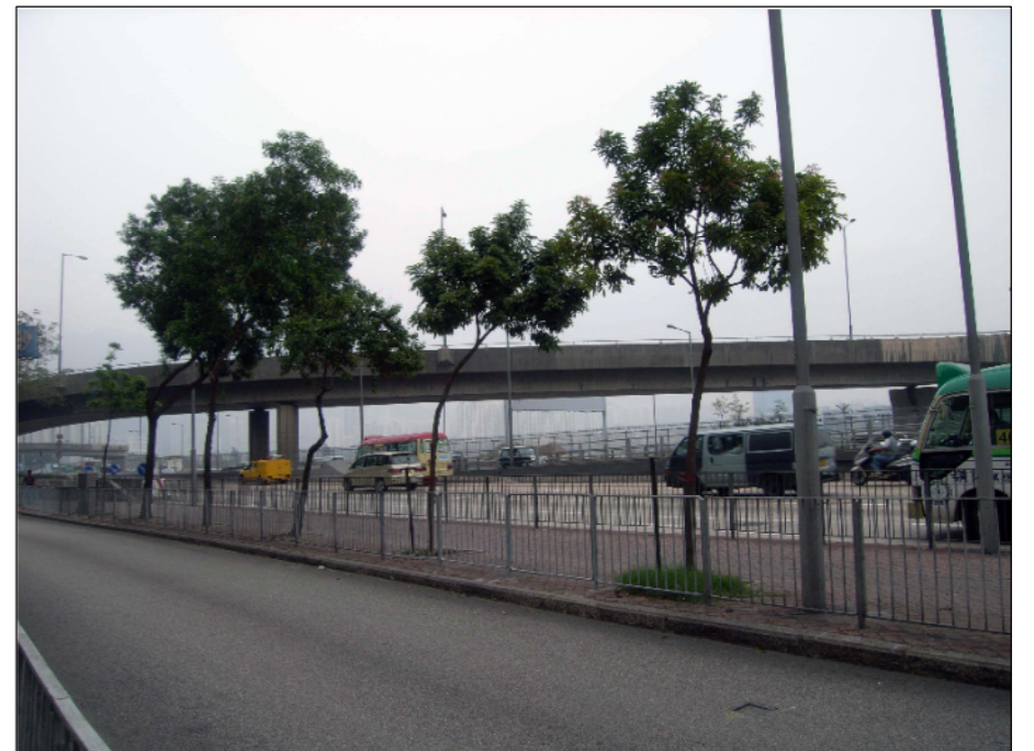
PHOTO D08 - R3 FROM LOW TO MEDIUM-RISE RESIDENTIAL DEVELOPMENT IN KOWLOON CITY