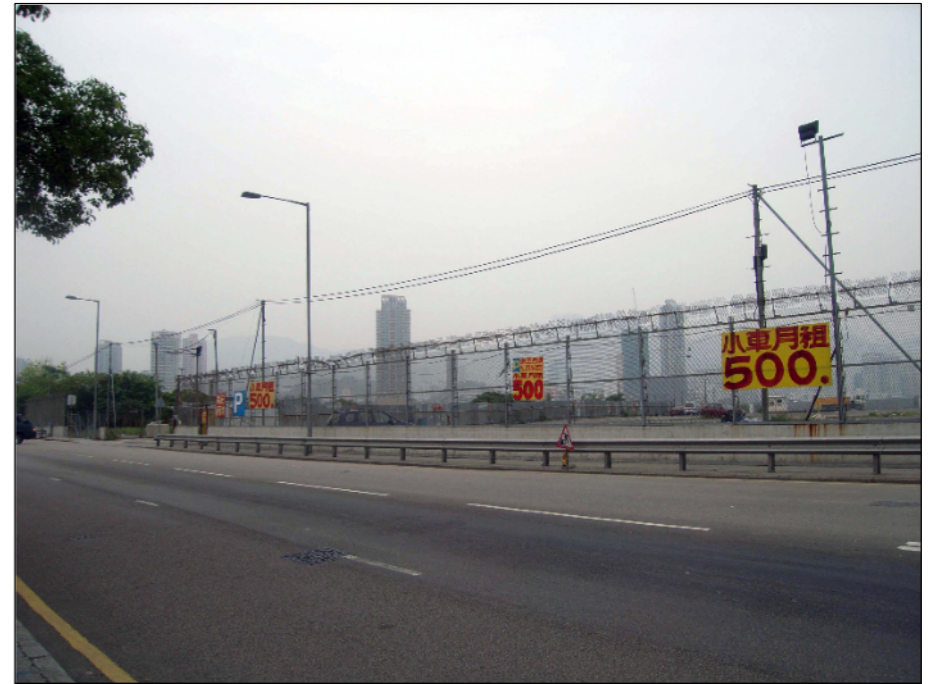
PHOTO D05 - T2 FROM SUNG WONG TOI ROAD