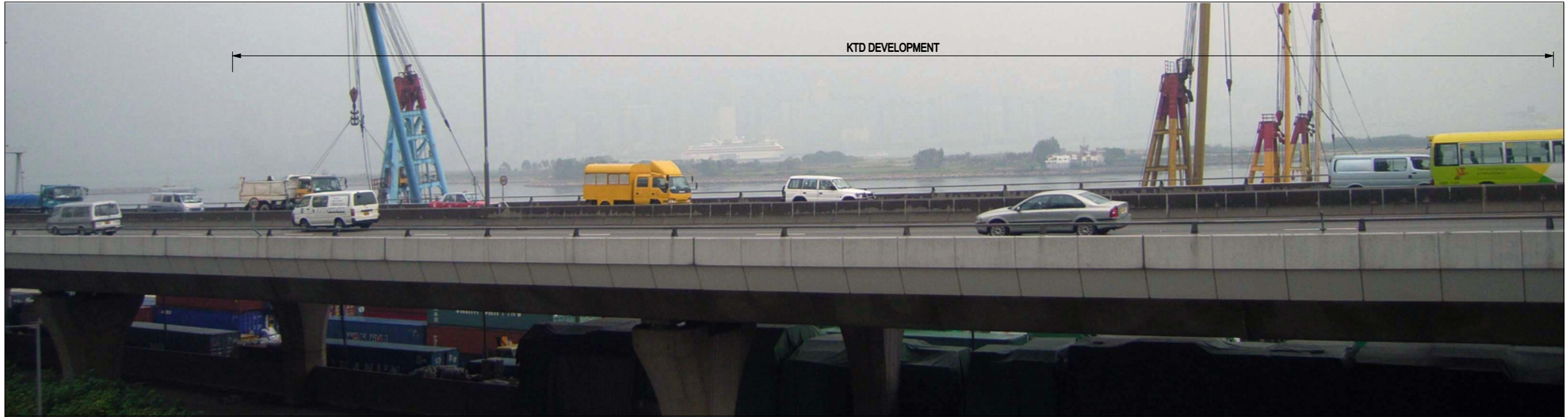
PHOTO D21 - OU5 FROM BUSINESS AND INDUSTRIAL DEVELOPMENTS IN KWUN TONG