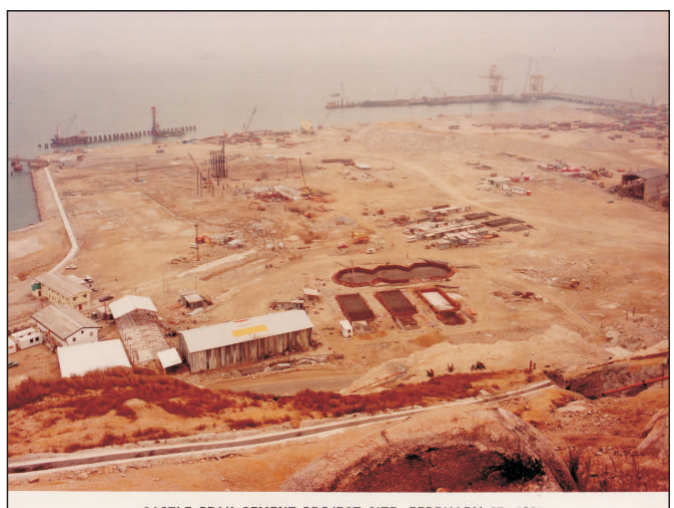
CASTLE PEAK CEMENT PROJECT SITE. FEBRUARY 27, 1981