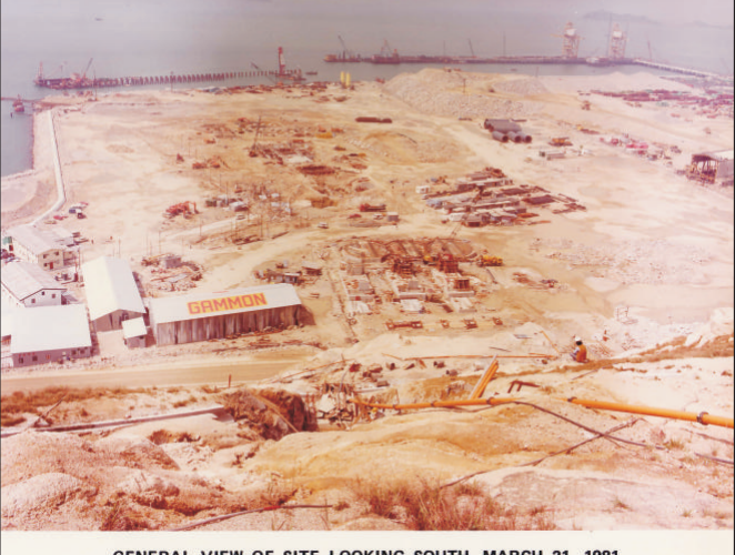
GENERAL VIEW OF SITE LOOKING SOUTH, MARCH 21, 1981.