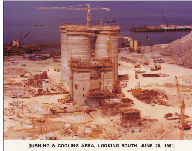
BURNING & COOLING AREA, LOOKING SOUTH. JUNE 20, 1981.