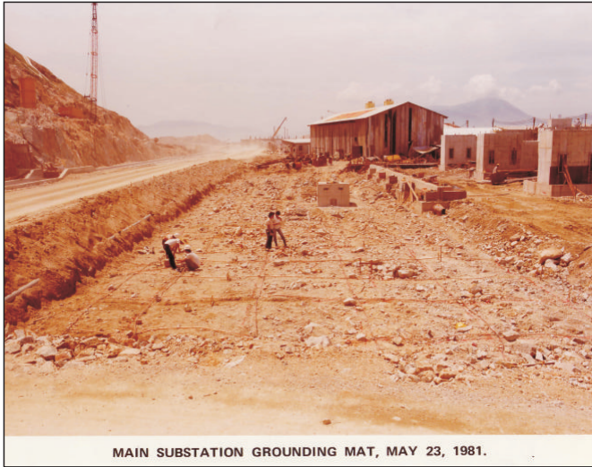
MAIN SUBSTATION GROUNDING MAT, MAY 23, 1981.