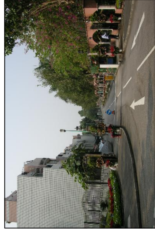
R1.1 Royal Palms and Palm Springs