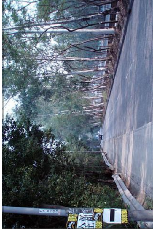
T 1.1 Castle Peak Road