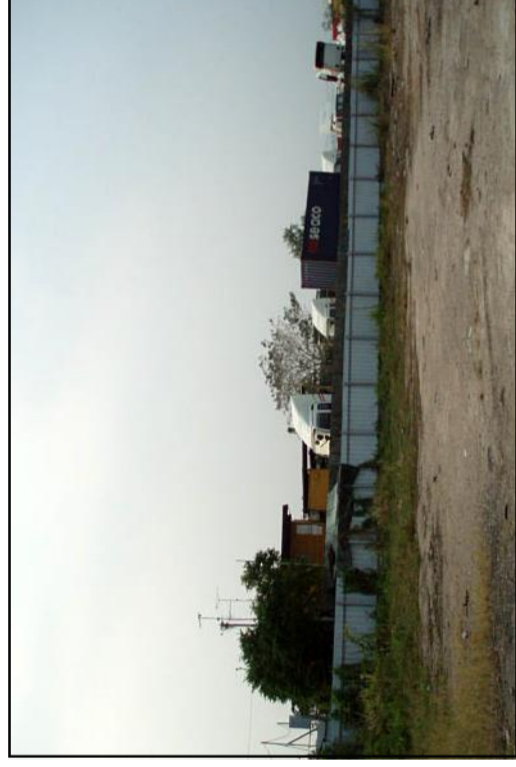
OU 1.1 Open Carpark