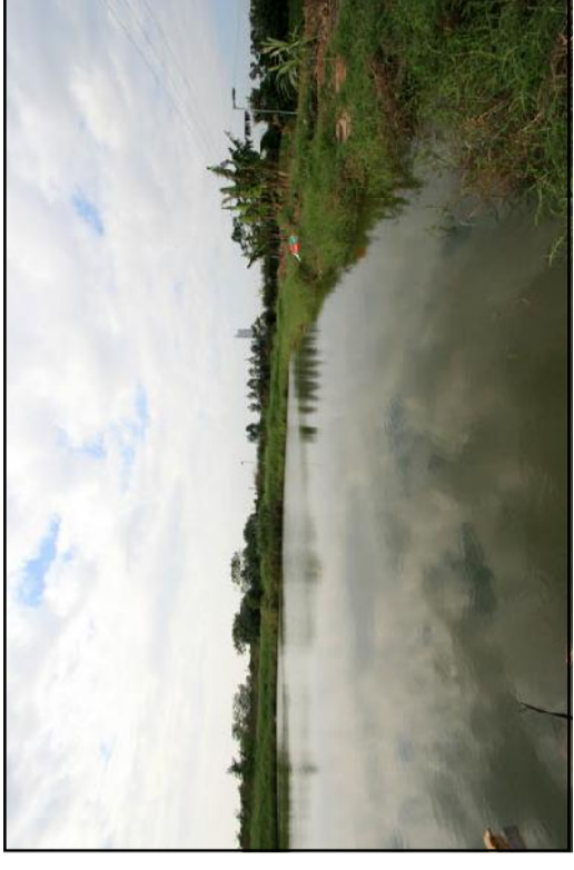
CA 1.4 Fish Ponds