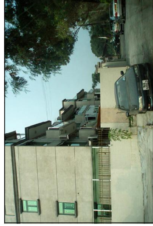
V 1.1 Mai Po San Tsuen