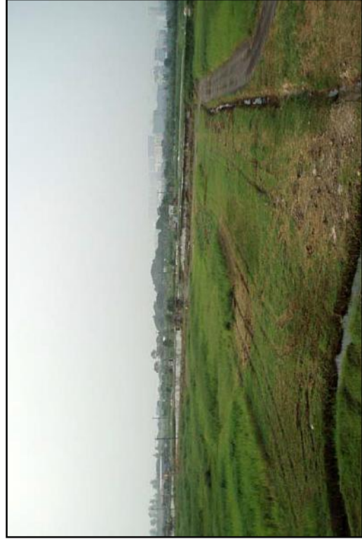
CDA 1.3 Wo Shang Wai Comprehensive Development Area