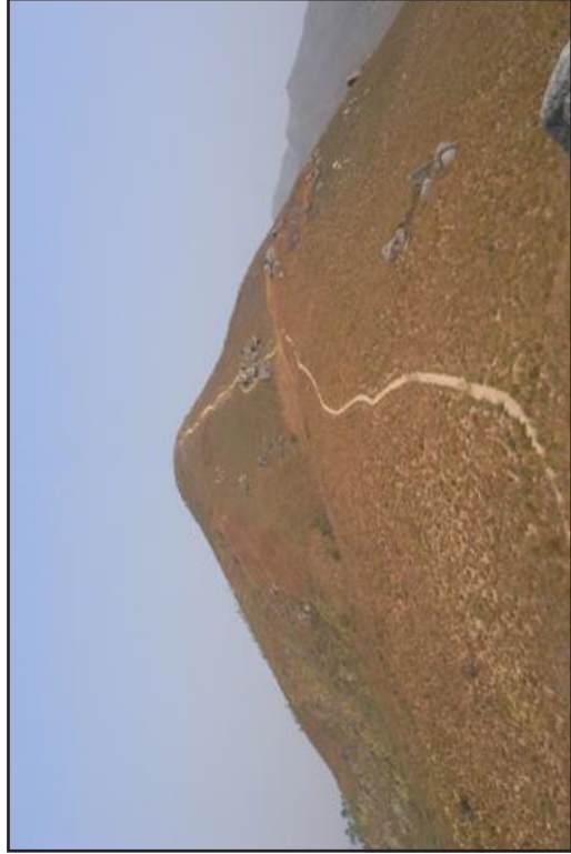
GB 2.1 Hillside of Kai Kung Lang