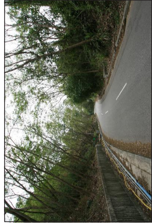
T 2.1 Chuk Yau Road