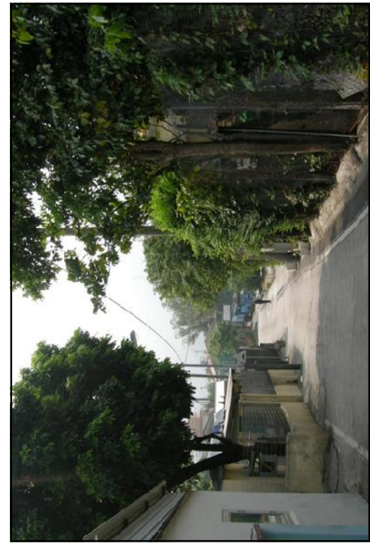
V 2.1 Yau Tam Mei Tsuen