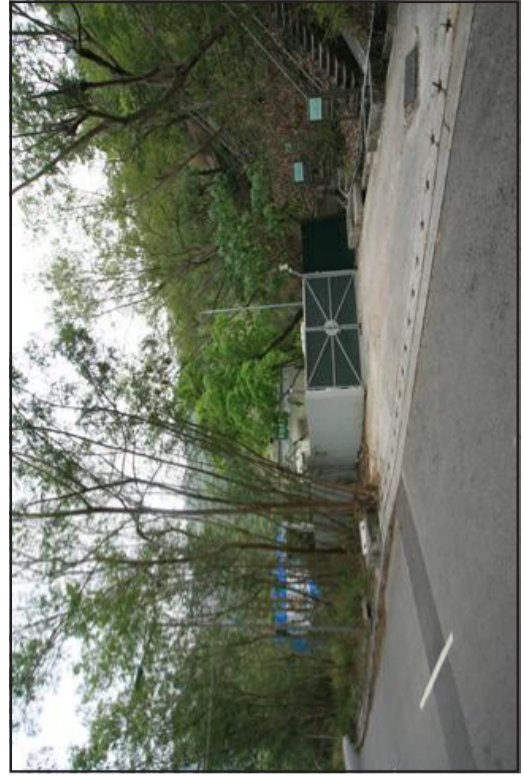
OU 2.1 Ngau Tam Mei Manure Processing Site