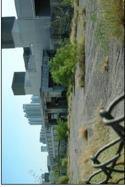
CDA 9.1 Nam Cheong Station Properties Development