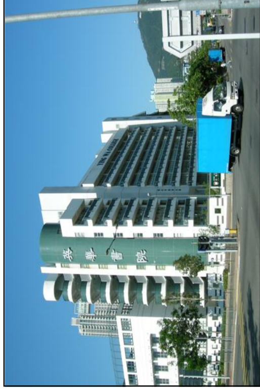
GIC 9.2 School along Sham Mong Street: St. Margaret's Co-educational English Secondary & Primary School and Ying Wah College