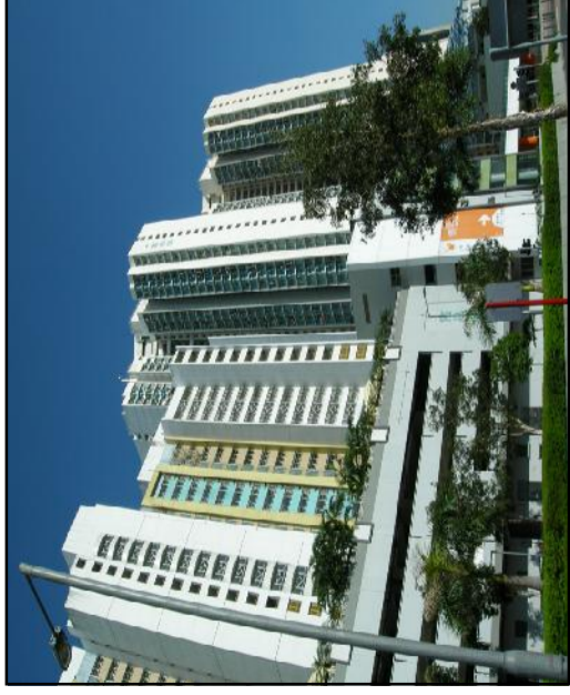
R 9.1 Fu Cheong Estate