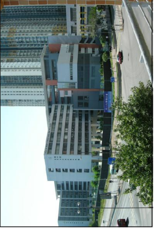
GIC 9.1 Schools along Hing Wah Street West: SKH St. Mary's Church Mok Hing Yiu College, SKH St. Andrew's Primary School, Tsung Tsin Christian Academy and Tack Ching Girls' Secondary School