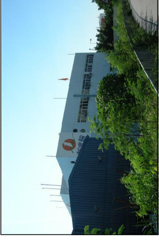
GIC 9.4 New World First Ferry