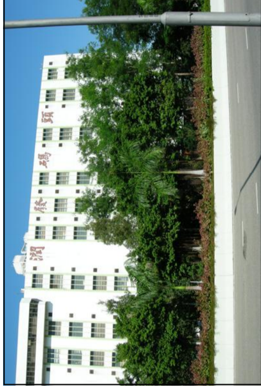
CDA 9.2 Yuen Fan Wharf & Godwton