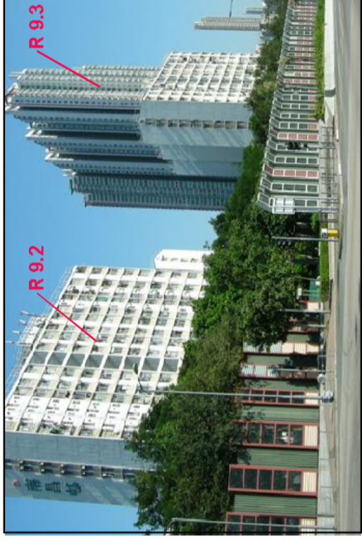
R 9.2 Nam Cheong Estate R 9.3 Metro Harbour View