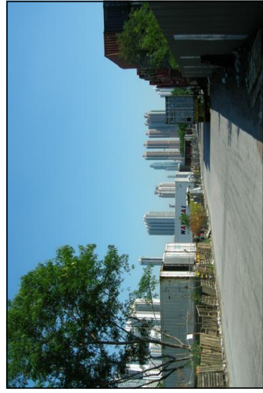
GIC 9.5 Open Car Park