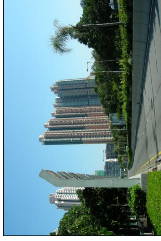
T 9.1 Sham Mong Road