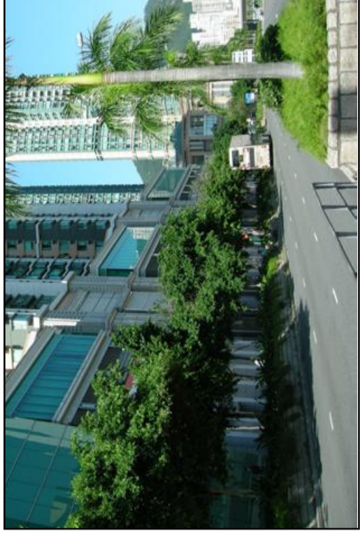
T 9.2 Hing Wah Street West