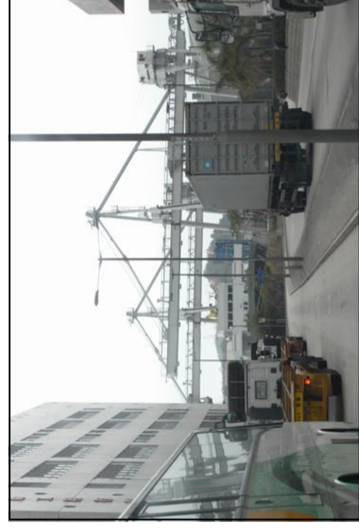
GIC 9.6 Dockland on Stonecutters and Island STW