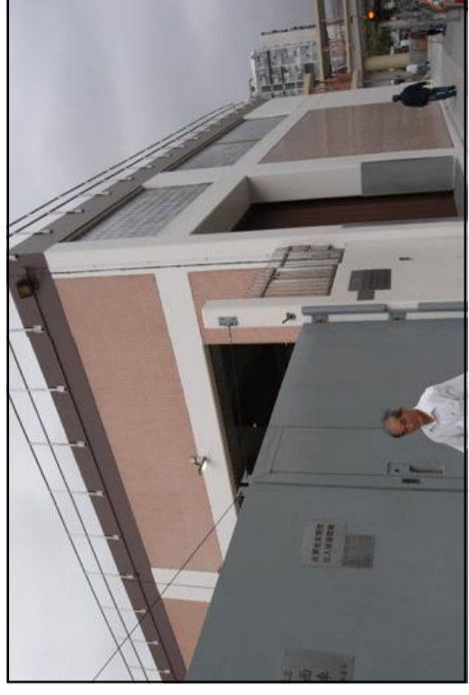
GIC 9.7 West Kowloon Central Sewage Pumping Station