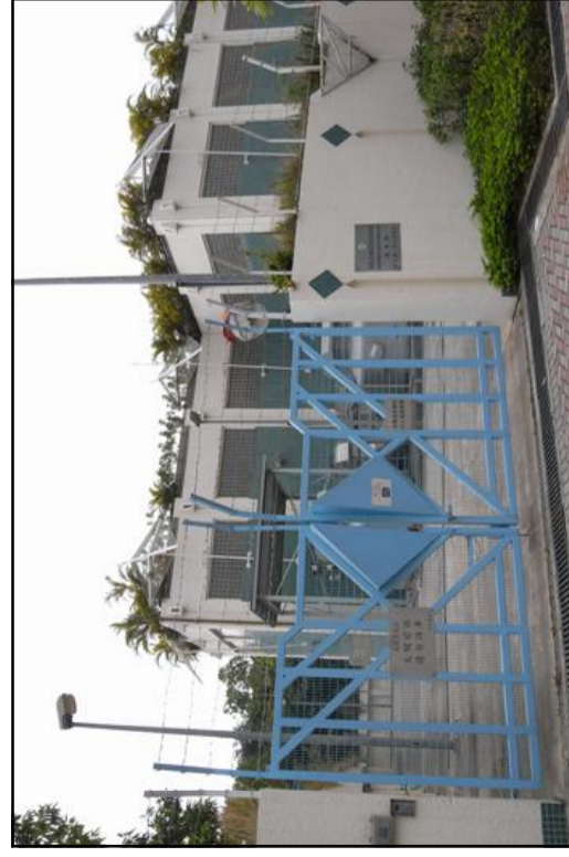
GIC 9.8 Sewage Treatment Screening Plant