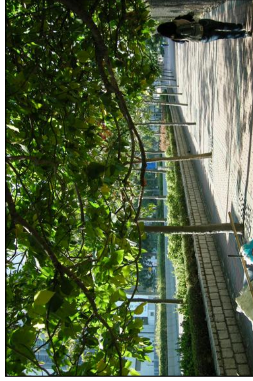
T 9.3 Tonkin Street West