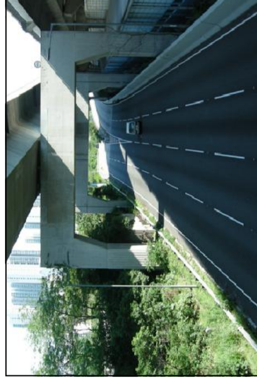
T 9.4 West Kowloon Highway