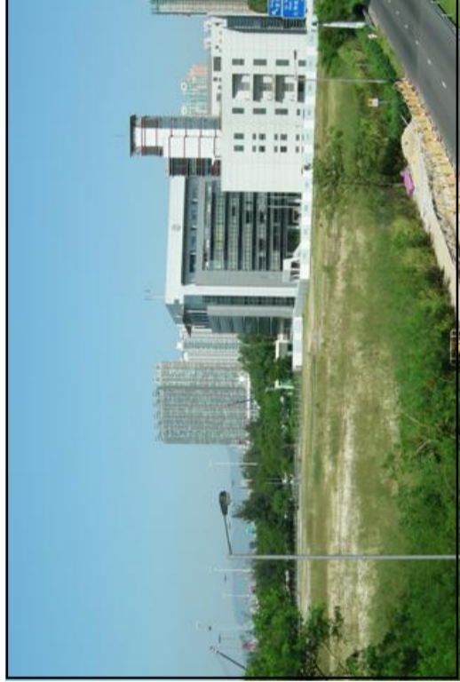
GIC 10.6 CAS Headquarter and FSD West Kowloon Rescue Training Centre