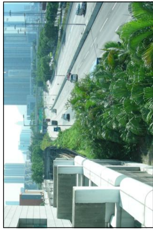
T 10.4 West Kowloon Corridor