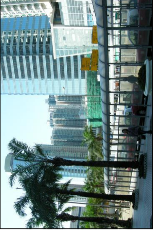
T 10.2 Cherry Street