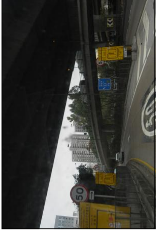
T 10.5 Waterloo Road