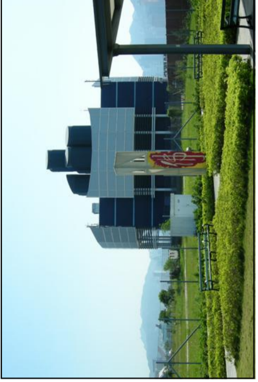
GIC 10.7 Western Harbour Crossing Administration Block