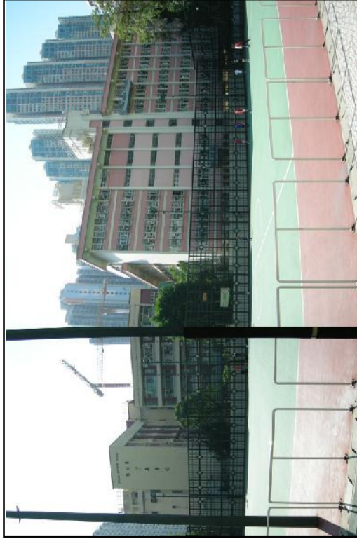
GIC 10.8 Schools on Cherry Street: CCC Ming Kei College and Sharon Lutheran School