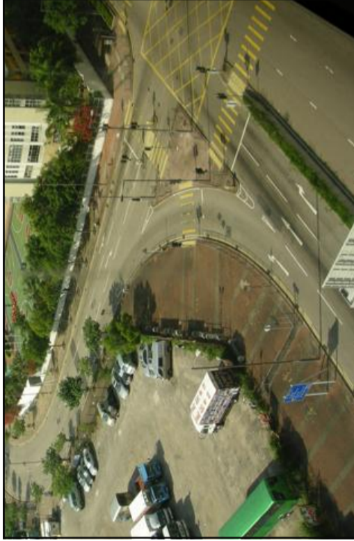
T 10.1 Hoi Wang Road and Hoi Ting Road