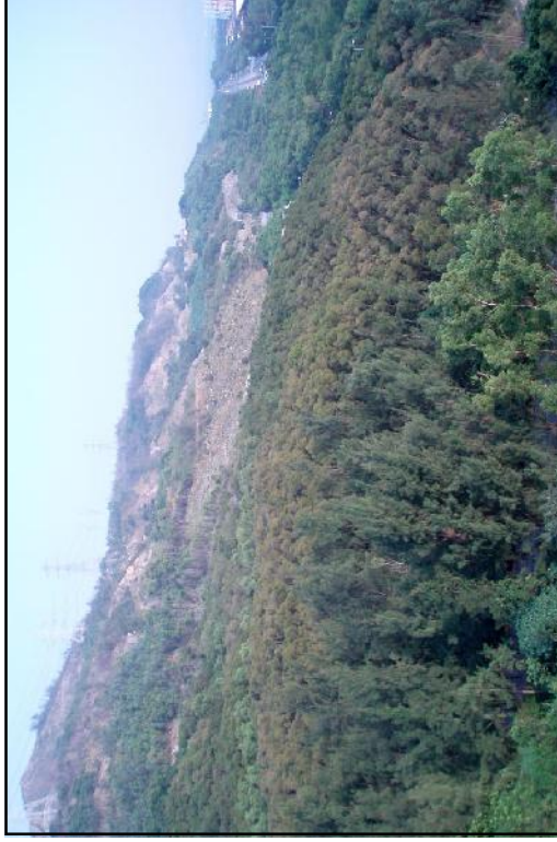
GB 15.1 Hikers