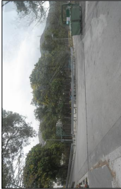
T 15.2 Siu Lang Shui Road