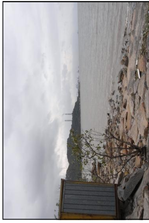
T16.2 Open water near Lung Kwu Sheung Tan