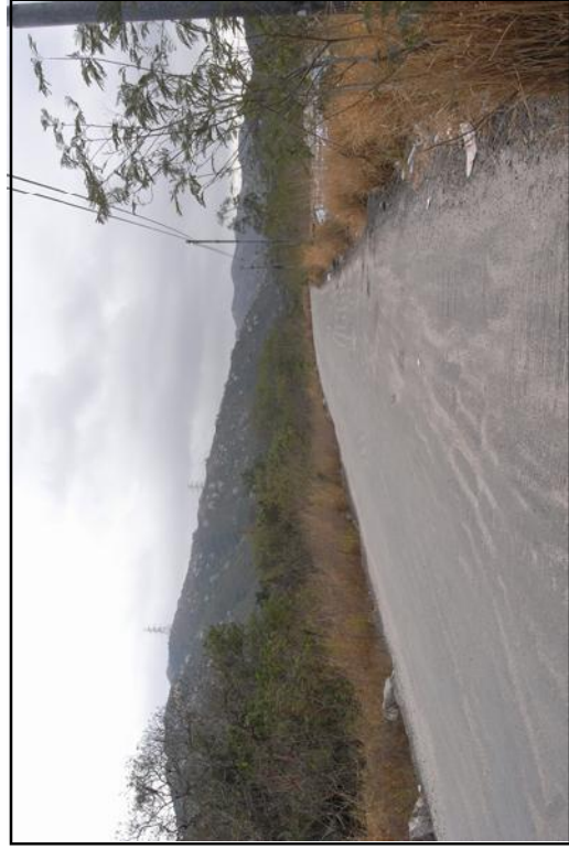
T 16.1 Lung Kwu Tan Raod