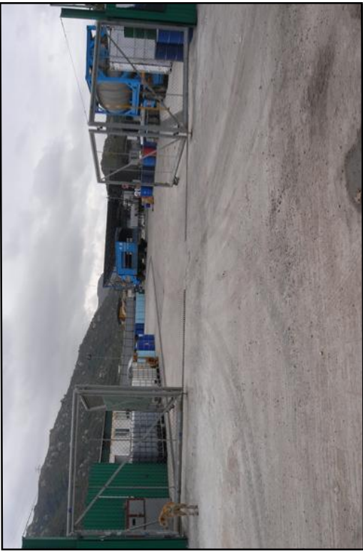
OU 16.1 Lung Kwu Sheung Tan Storage Compound