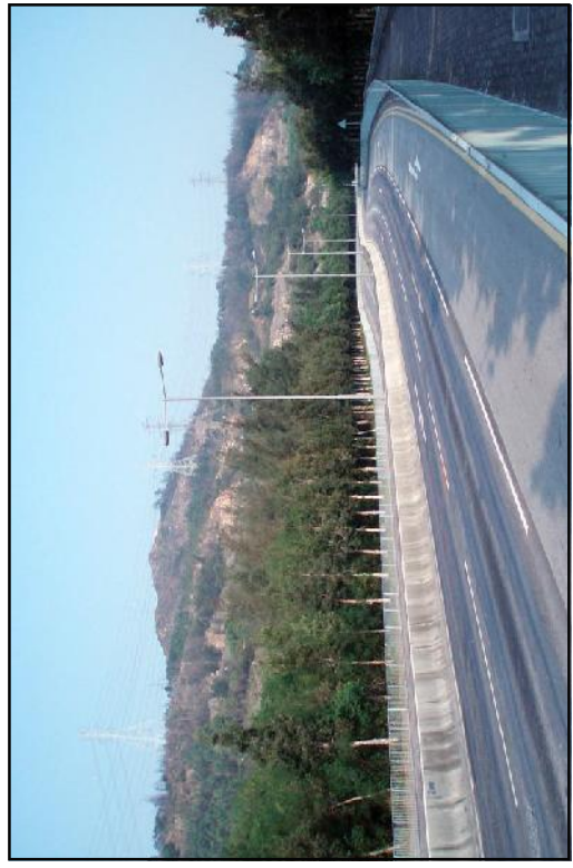
T 15.1 Lung Mun Road