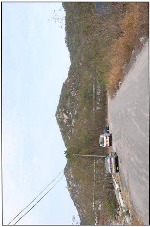
GB 16.1 Hikers at Black Point