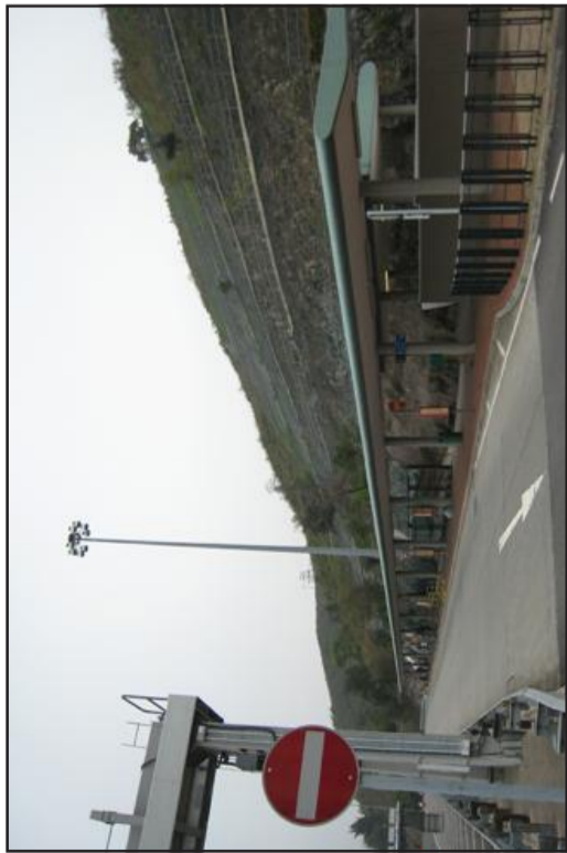
T 18.2 North Lantau Highway and Lantau Toll Plaza Administration Building