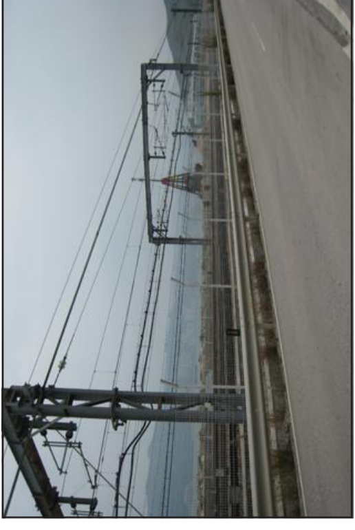
T 18.1 Airport Express Rail