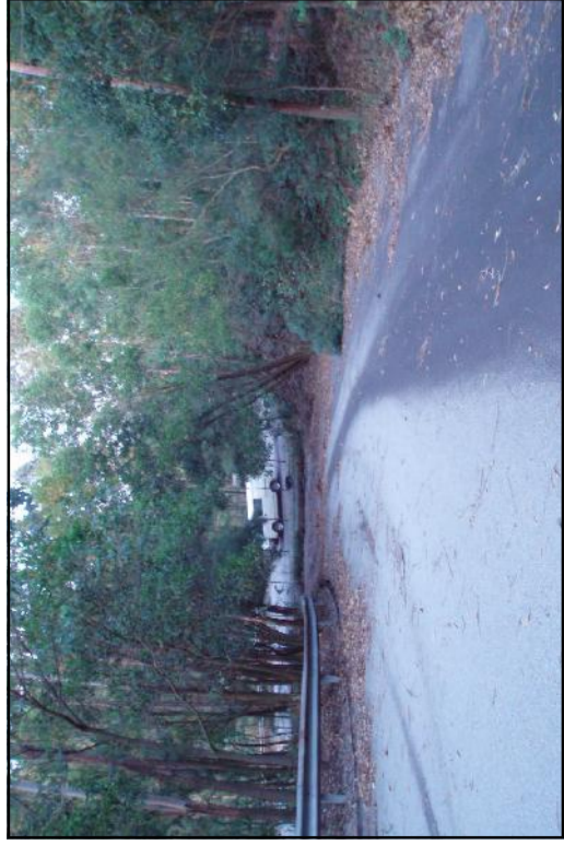
T 17.1 Tai Shu Ha Road West