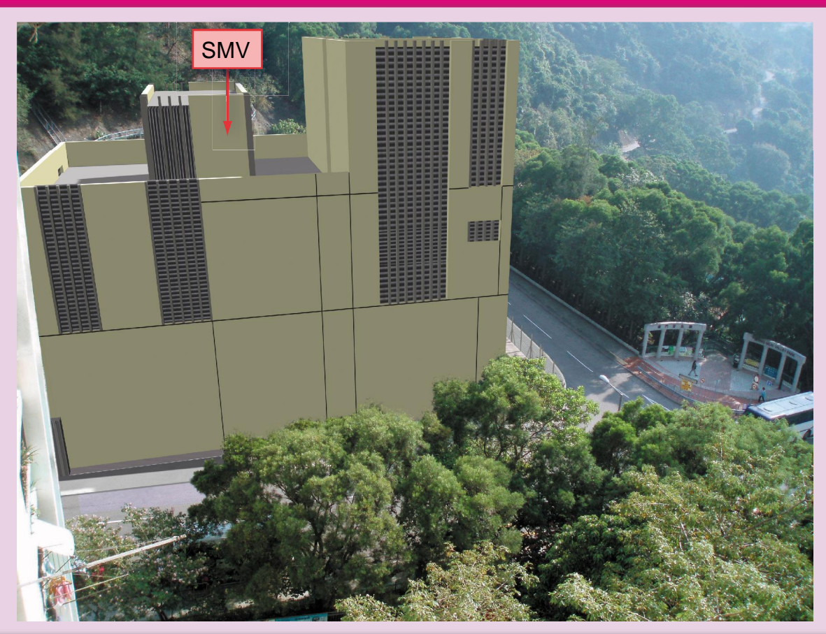
10 Years with Mitigation Measure