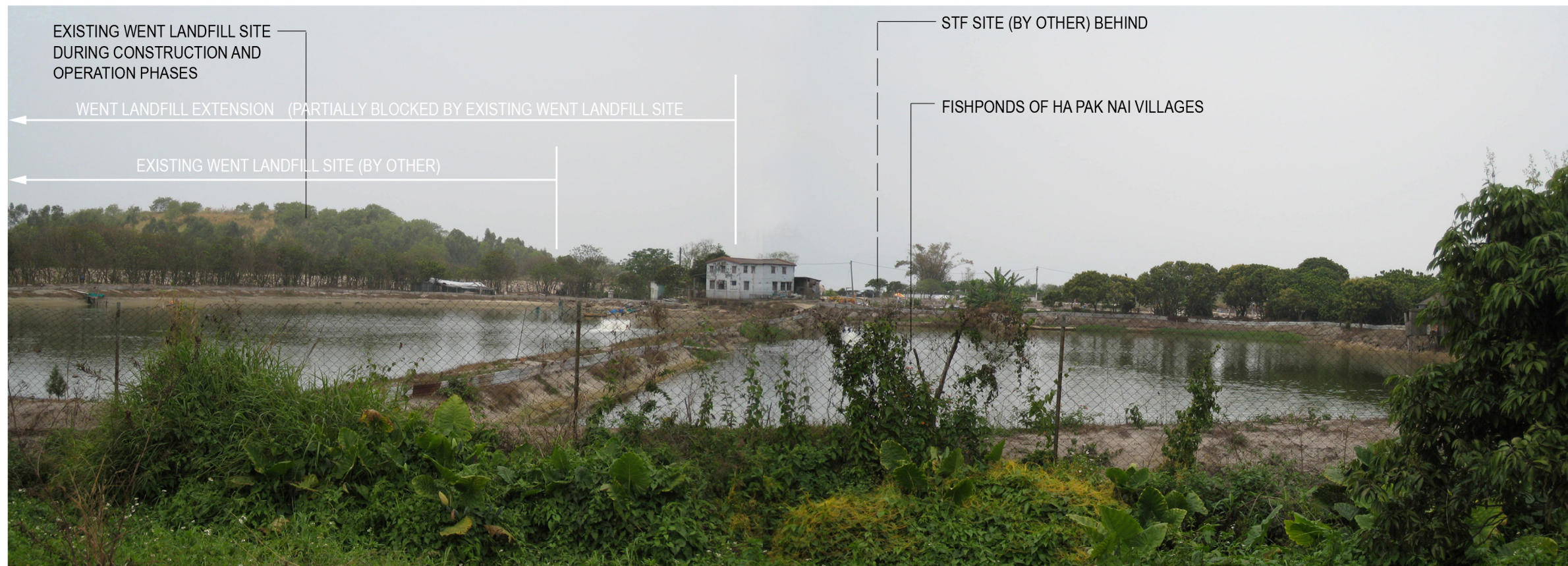
Existing Baseline Condition (Day 1 of Construction and Operation Phases)