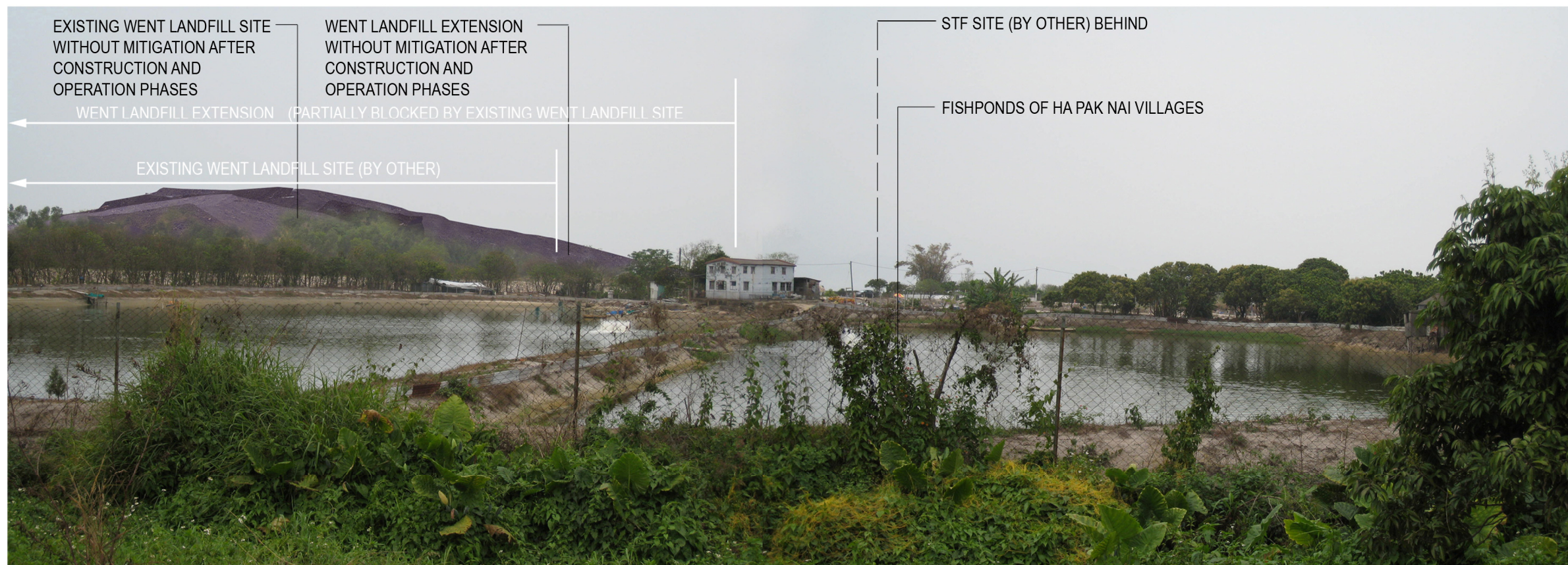
Development without Mitigation (Day 1 of Restoration and Aftercare Phases)