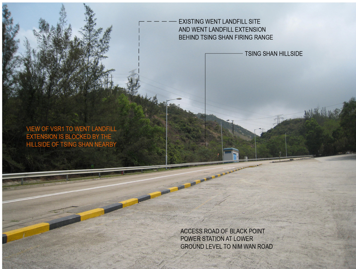
Existing Baseline Condition (Day 1 of Construction and Operation Phases)