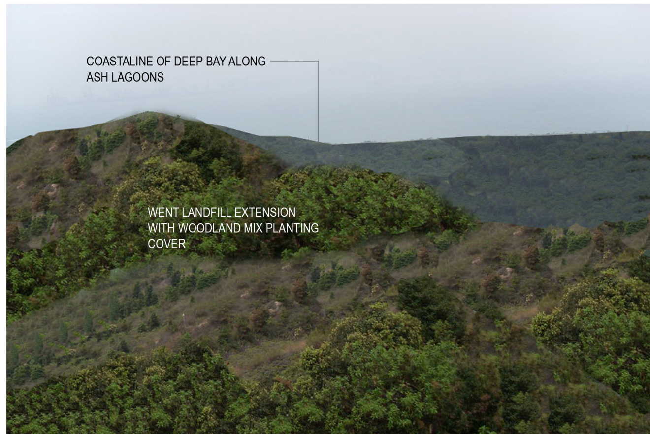
Development with Mitigation (Year 10 of Restoration and Aftercare Phases)