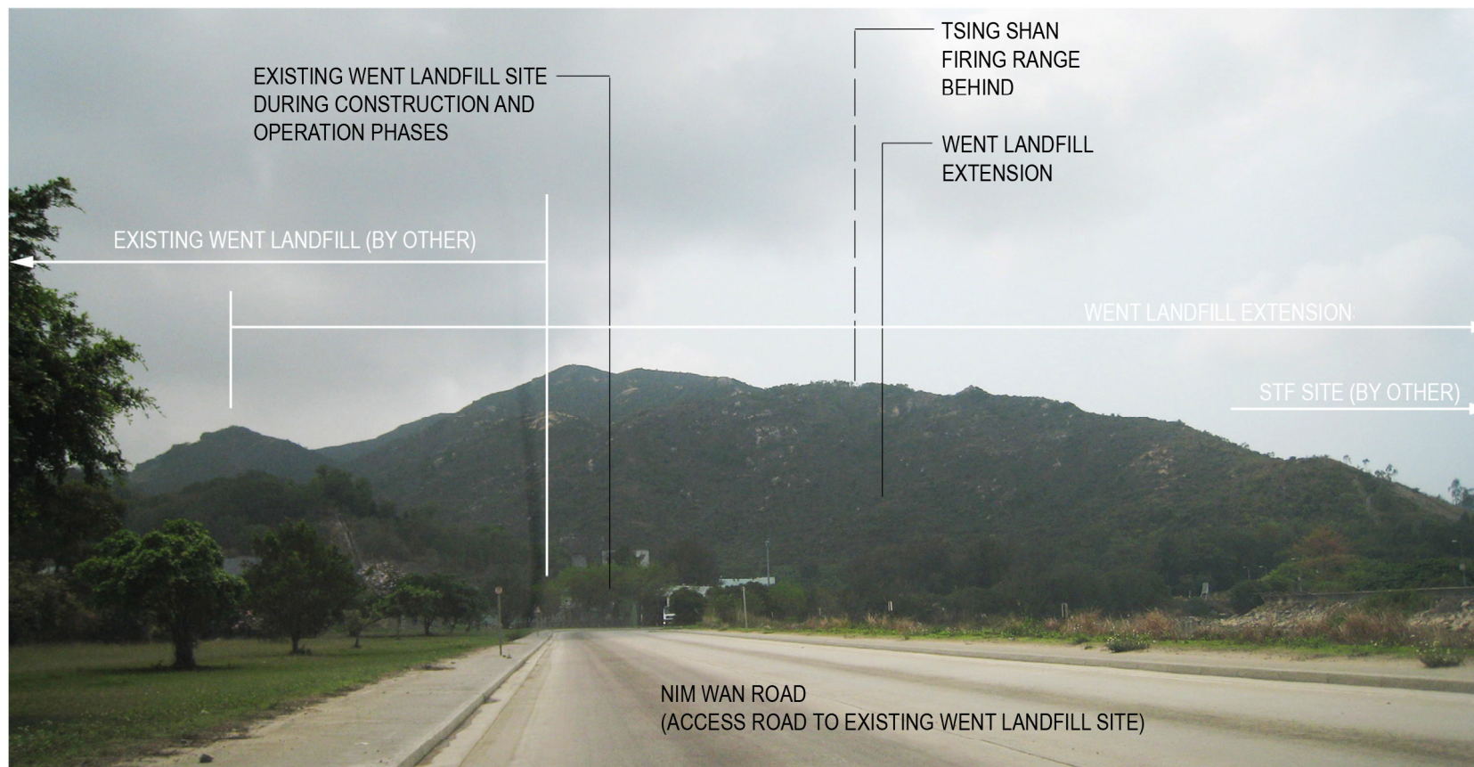
Existing Baseline Condition (Day 1 of Construction and Operation Phases)