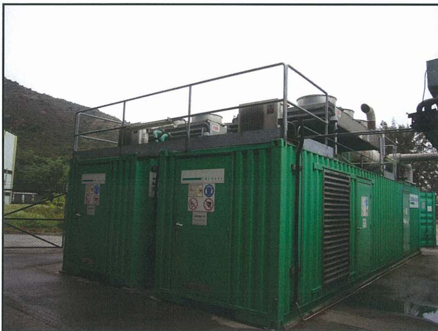
Gensets for power generation using landfill gas