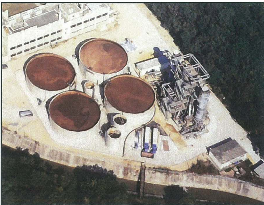
Ammonia Stripping Plant using landfill gas to heat up raw leachate