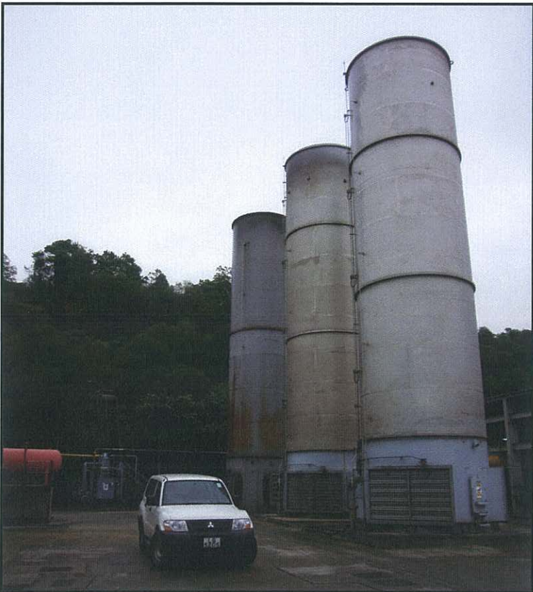
Landfill gas flares