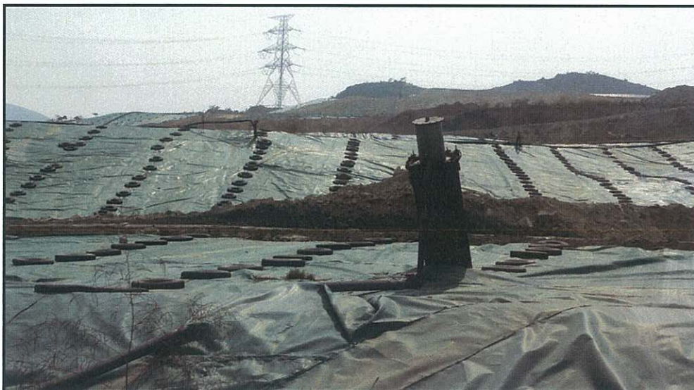
Landfill gas extraction well