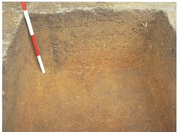
6. T24 East Wall