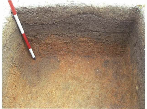
2. T16 East Wall