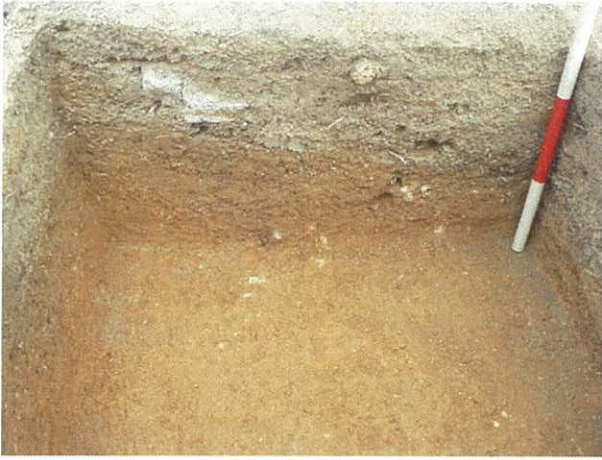
1. T28 North Wall