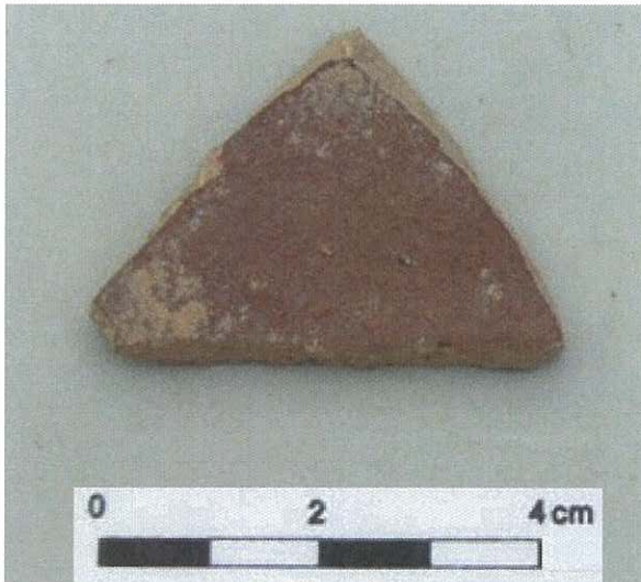
2. Glazed Stoneware Shard (T19C2:1)