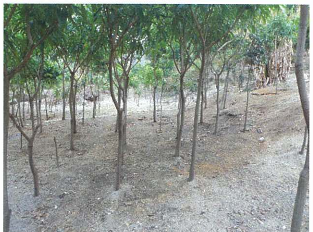
6. Zone South East (N to S)