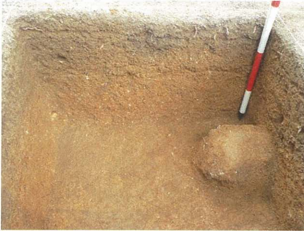
1. T25 North Wall