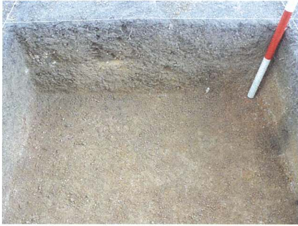
1. T22 North Wall