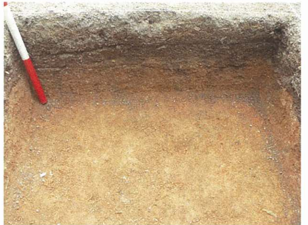
6. T18 East Wall