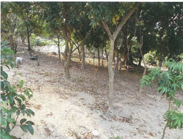
3. Zone West East (E to W)