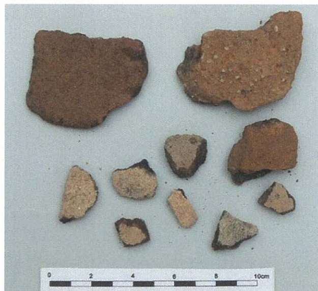
4. Shards from T16C3