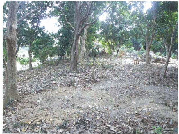
2. Zone North West ( N to S)