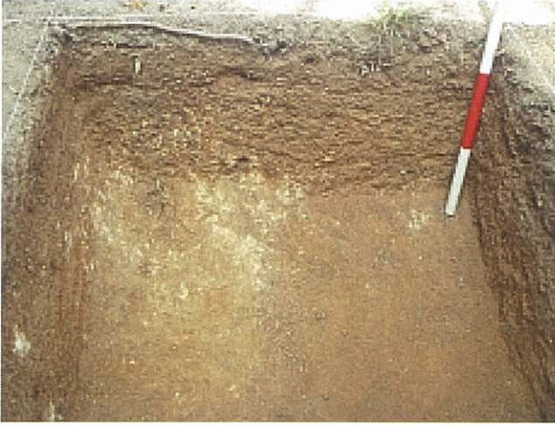
1. T19 North Wall