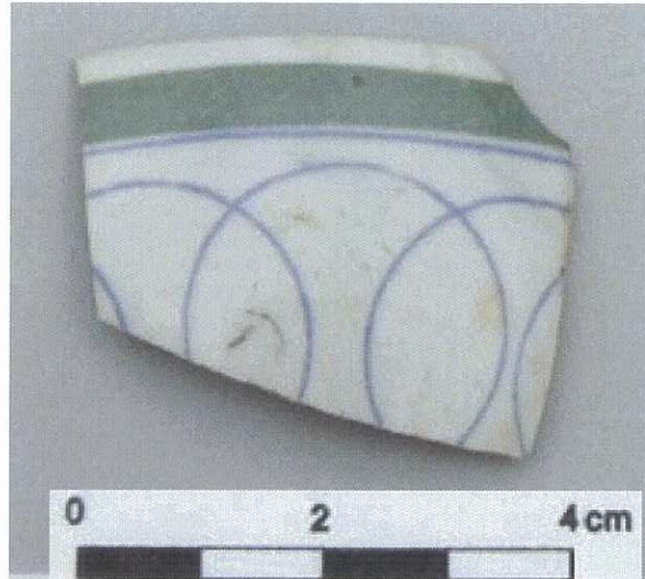
1. B/W Porcelain Shard (T16C1:1)