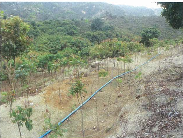
5. Zone South West (N to S)