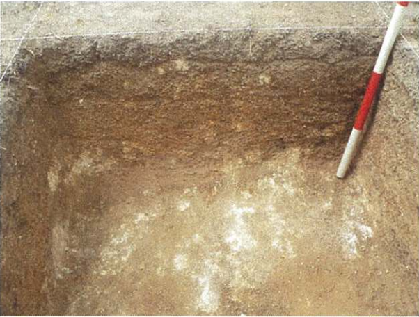
3. T20 North Wall