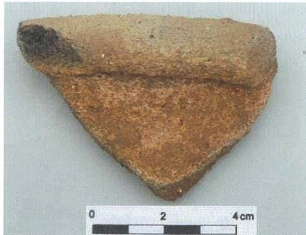
1. Rim (T16C3:1)