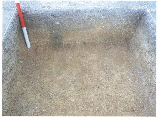
2. T22 East Wall