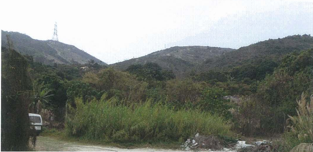
2. Study Area Viewed from East