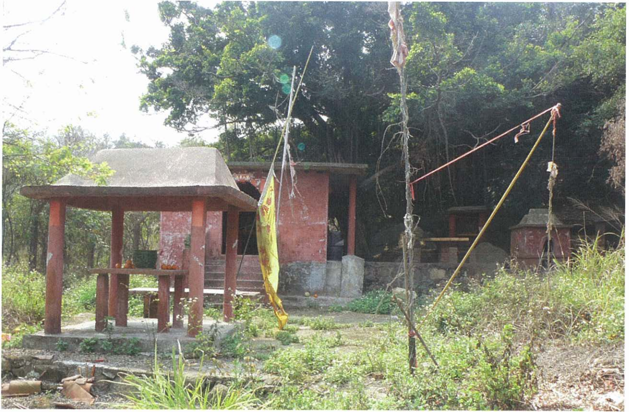
1. Temple Site (Left to Right: Pavilion, Hung-Shing Palace, Altar, and Furnace)