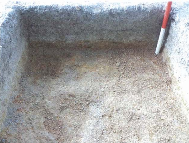
5. T21 North Wall