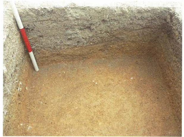
2. T28 East Wall