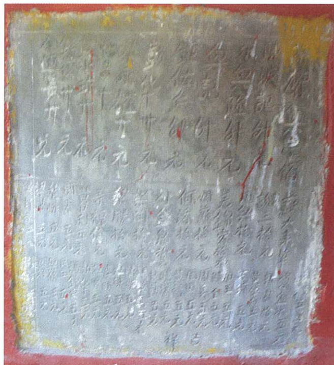
2a. Remaining Old Stone Tablet