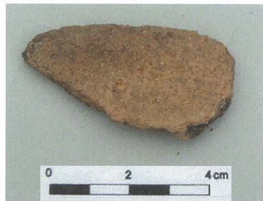
3. Rim with Cord Marks (T16C3:3)