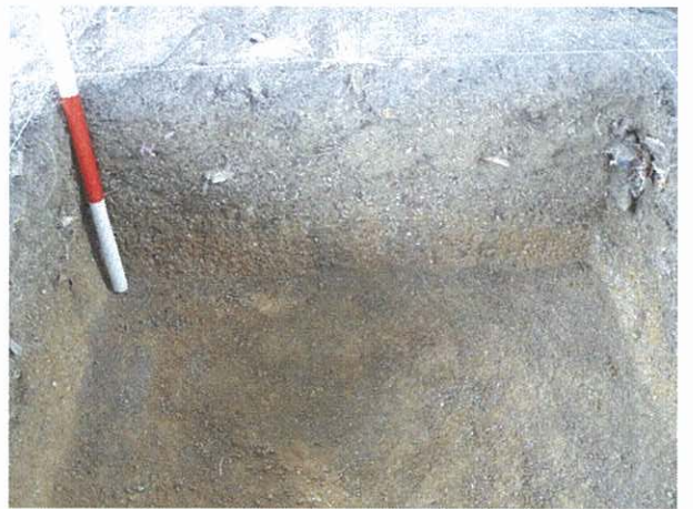
4. T17 East Wall