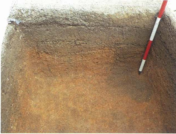
1. T16 North Wall