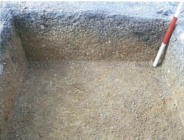
3. T26 North Wall