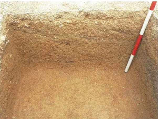
5. T27 North Wall