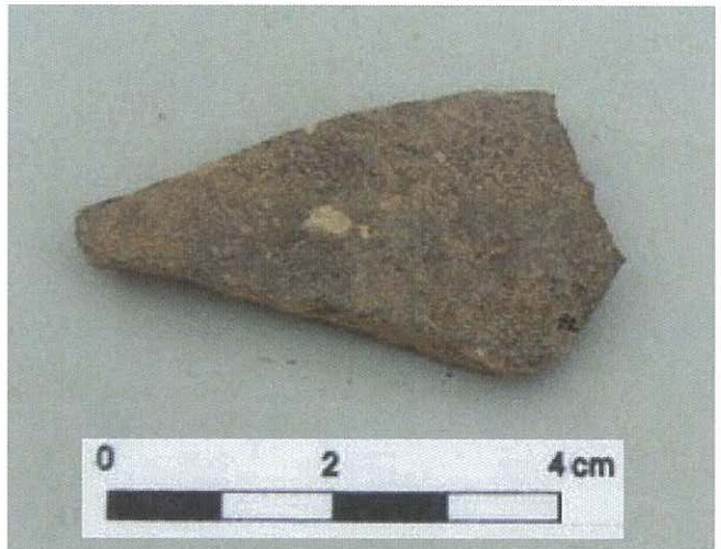
3. Glazed Stoneware Shard (T20C2:1)