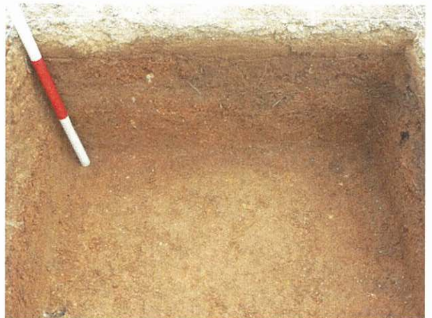
6. T30 East Wall