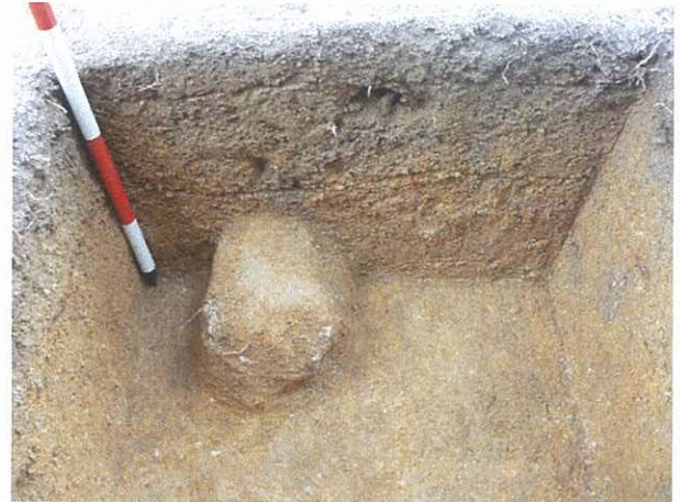
2. T25 East Wall