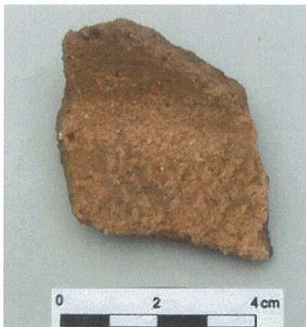
2. Cord-marked Shard (T16C3:2)