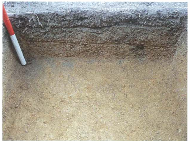
4. T23 East Wall