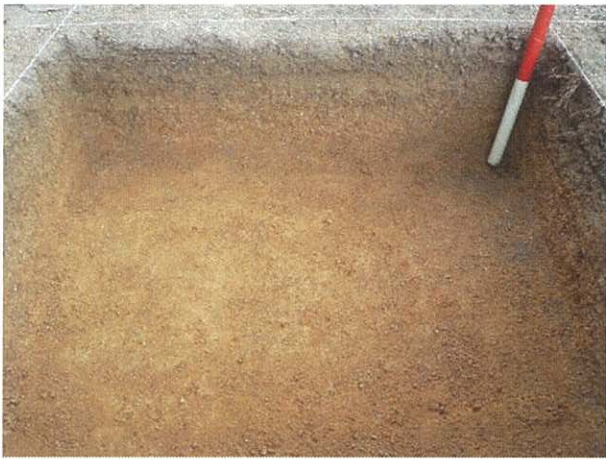
3. T23 North Wall