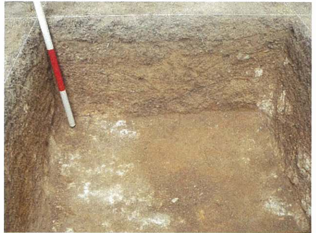
4. T20 East Wall