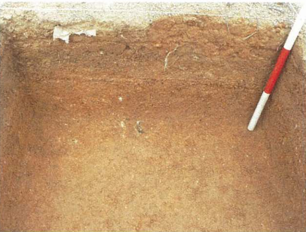
5. T30 North Wall