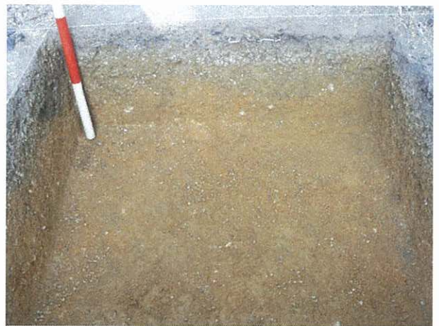
4. T26 East Wall