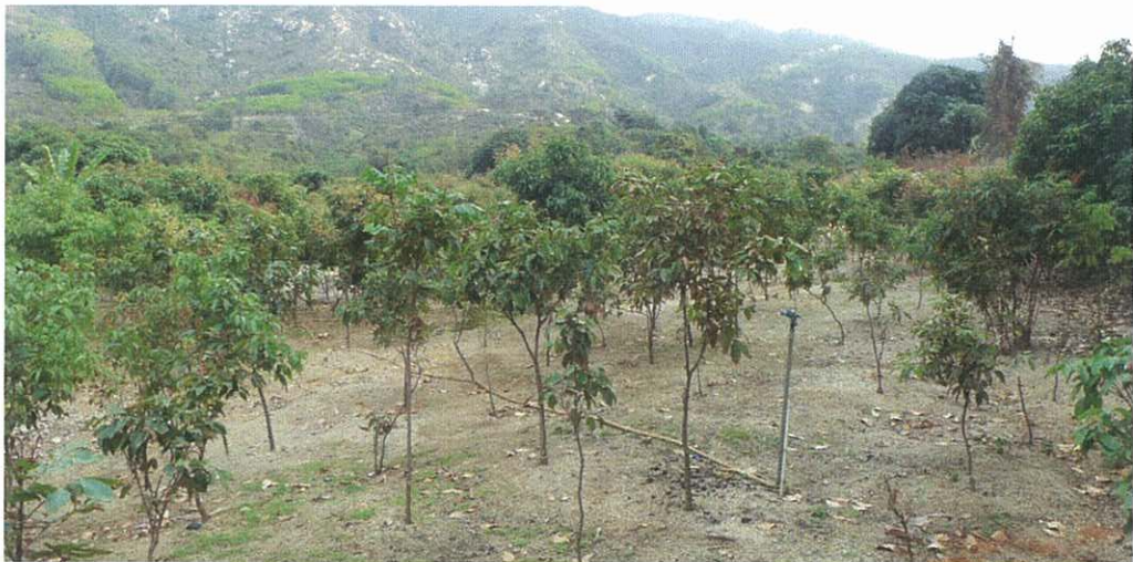
3. Terrace with Archaeological Discovery (N to S)