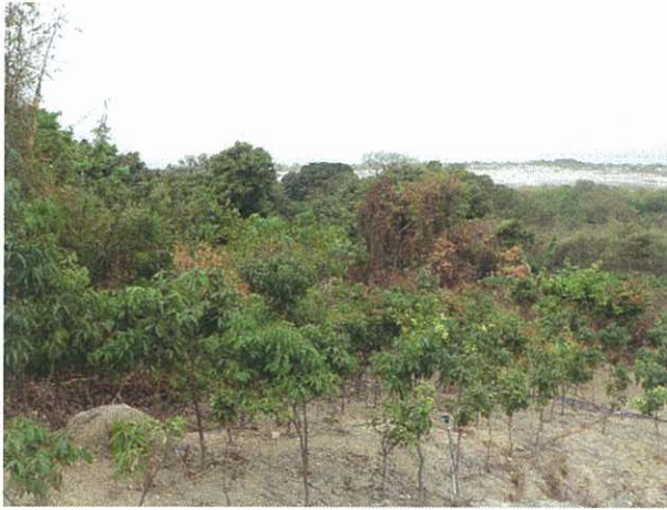
1. Zone North East ( S to N)