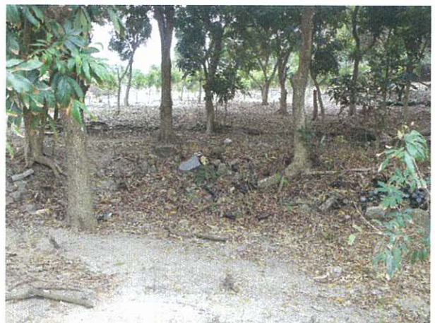
4. Zone West West (E to W)