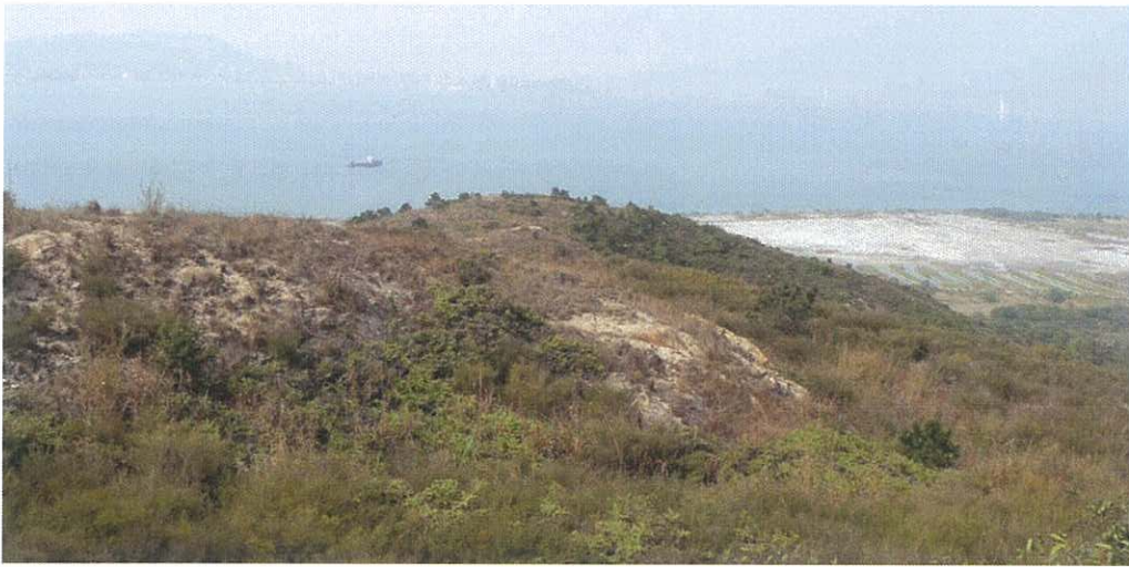
1. Study Area Viewed from South