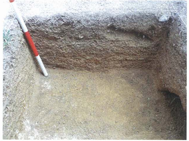
2. T19 East Wall