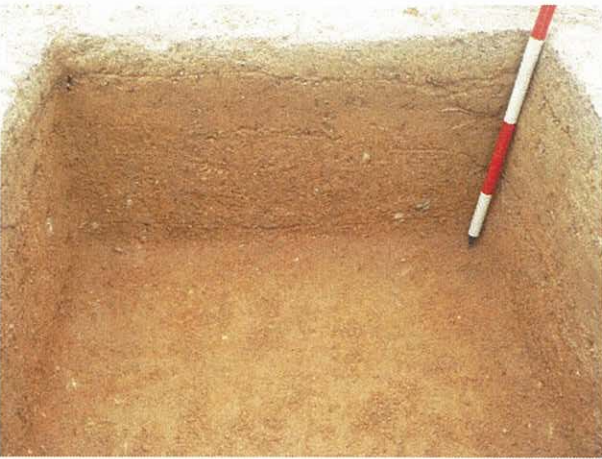
3. T29 North Wall