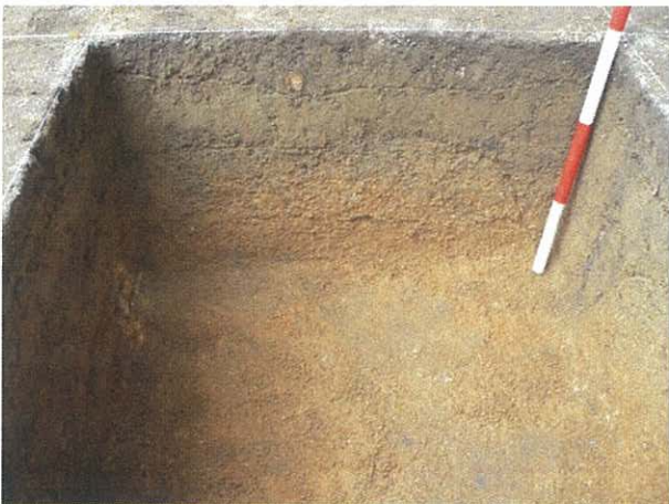
5. T24 North Wall