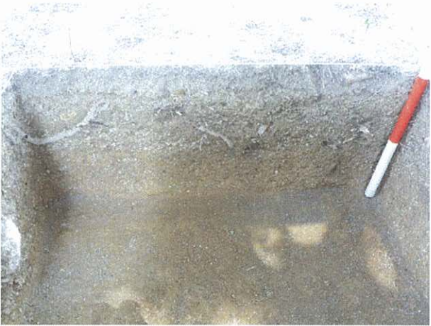
3. T17 North Wall