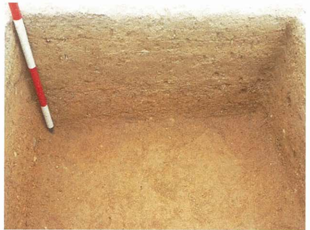
4. T29 East Wall