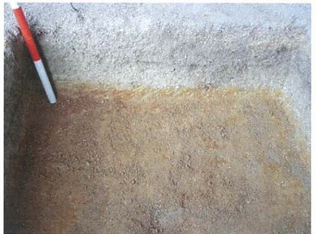
6. T21 East Wall