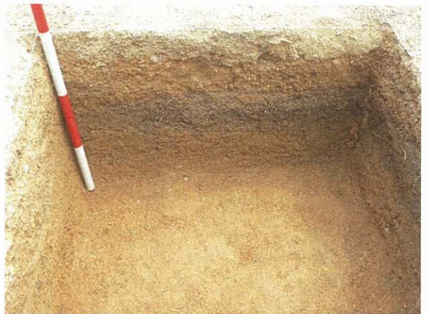
6. T27 East Wall