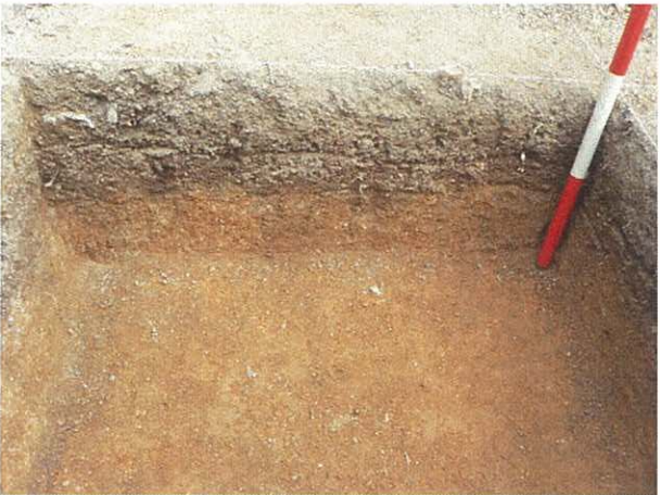
5. T18 North Wall