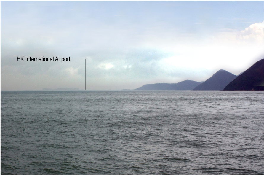
Existing Baseline Condition