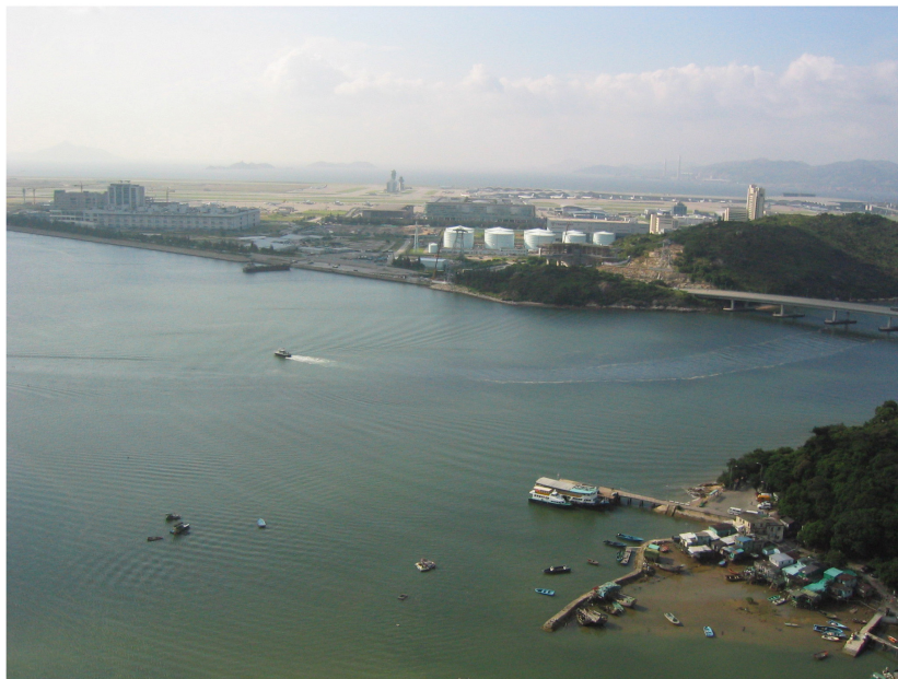
Existing Baseline Condition