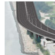
Screening planting at columns and underneath area

Note: Some urban design elements of HKLR, e.g. aesthetic structural forms of parapets, soffits, columns, railings, decorative road lightings and so on should be considered during detailed design stage in order to enhance the appearance of HKLR visually.