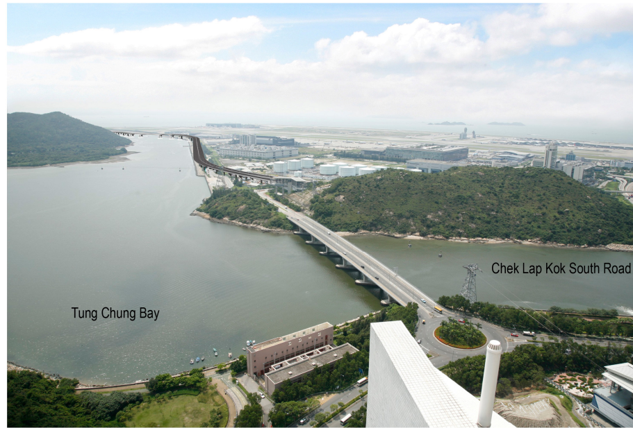
Development with Mitigation (Day 1 of Operation Phase)