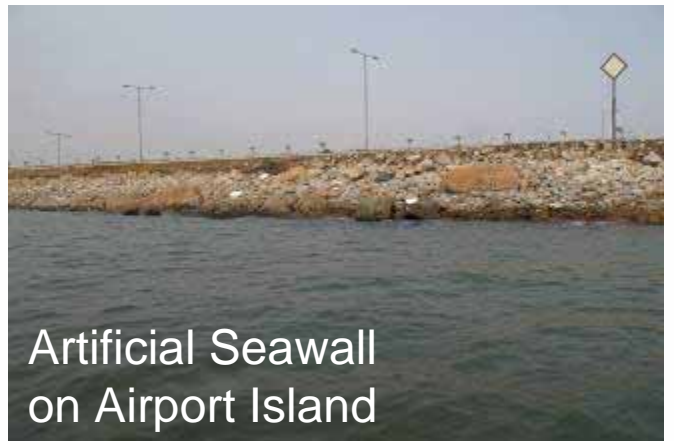
Artificial Seawall on Airport Island