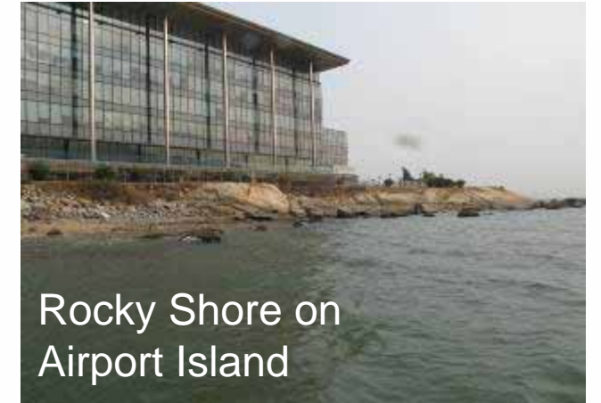
Rocky Shore on Airport Island