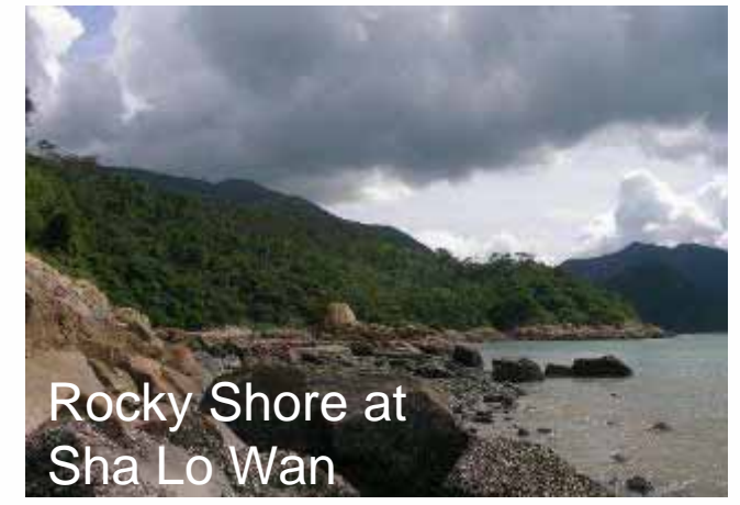
Rocky Shore at Sha Lo Wan