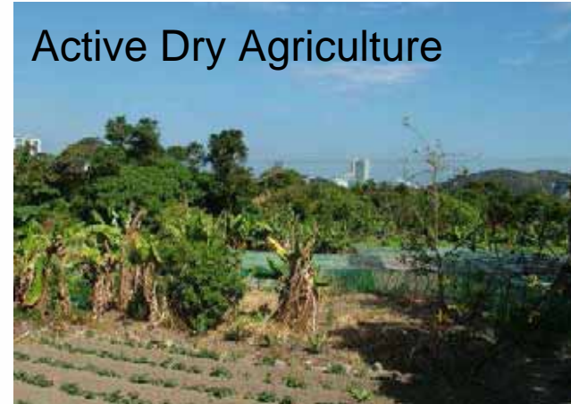
Active Dry Agriculture