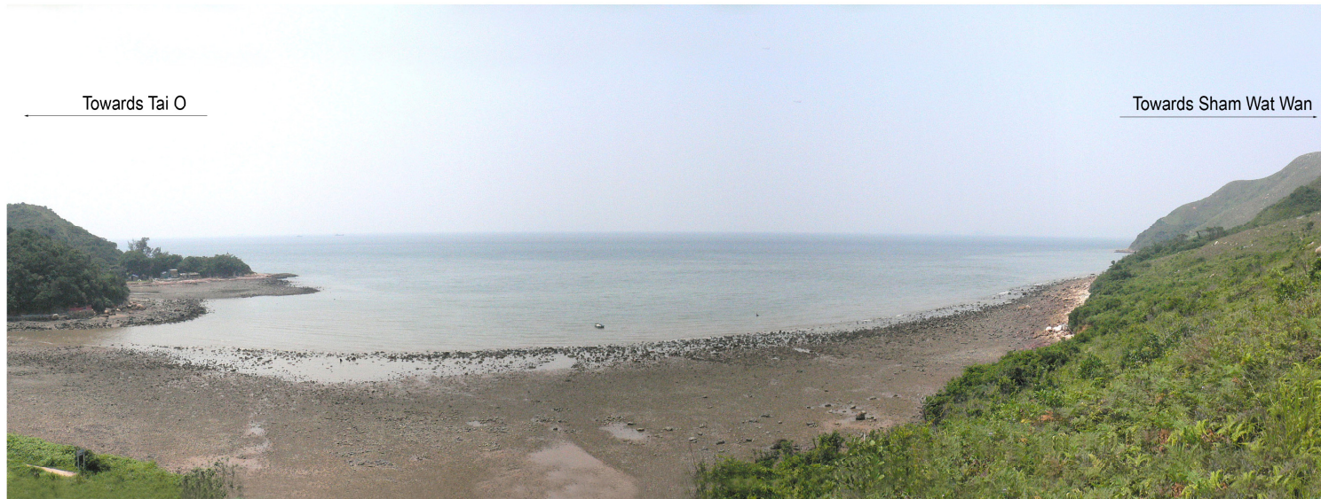
Existing Baseline Condition