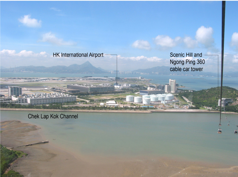
Existing Baseline Condition