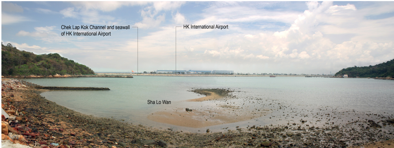
Existing Baseline Condition