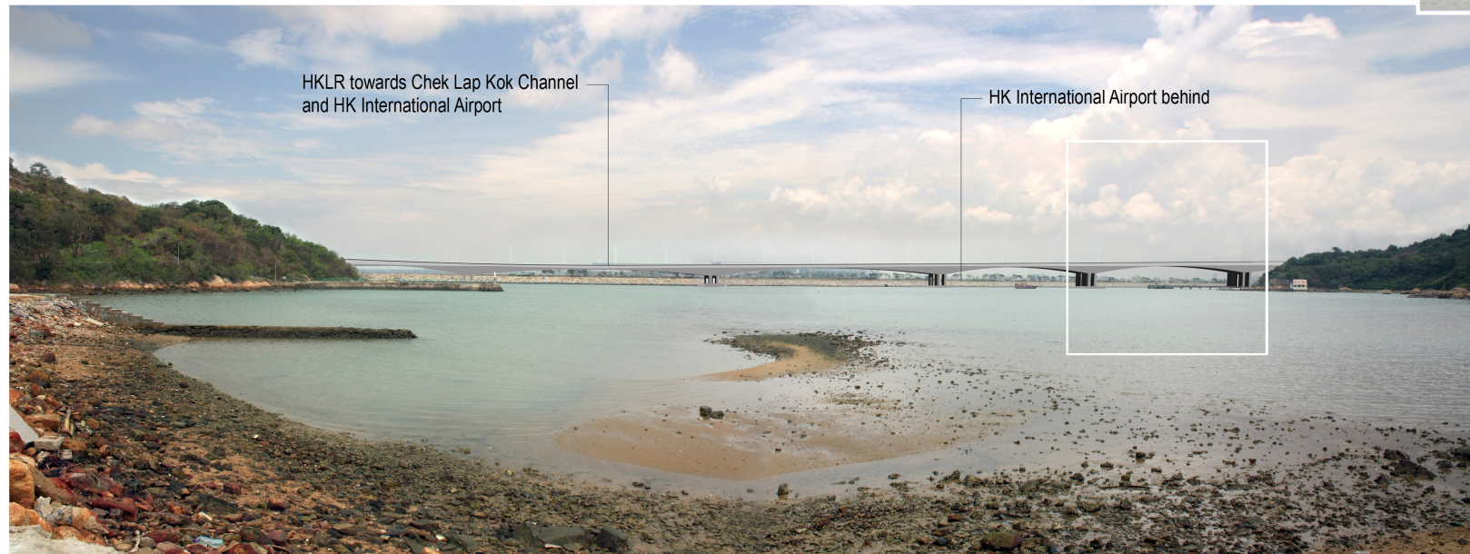
Development with Mitigation (Day 1 and Year 10 of Operation Phase)