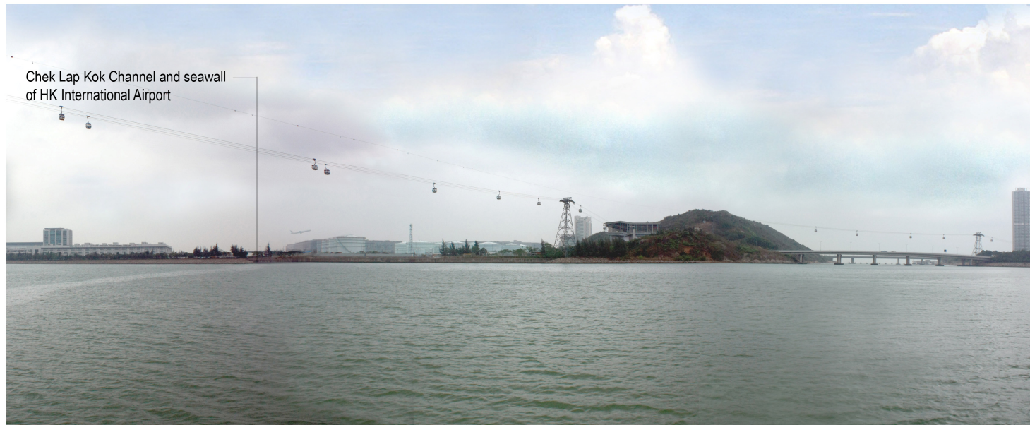
Existing Baseline Condition