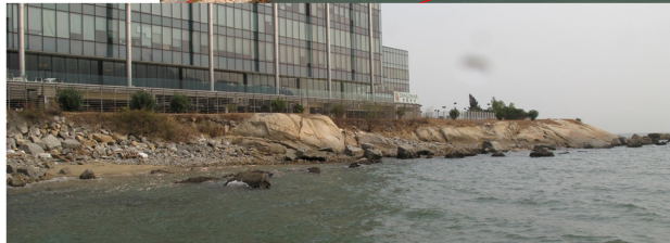
Combination of sand, artificial rockfill and natural rocks indicates human disturbance. Original backshore vegetation has been replaced with scattered exotic trees