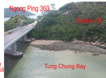
Ngong Ping 360