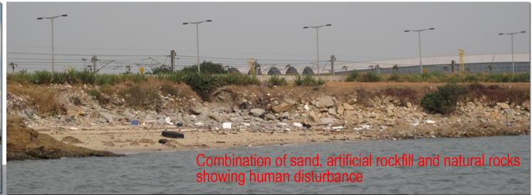
Combination of sand, artificial rockfill and natural rocks showing human disturbance